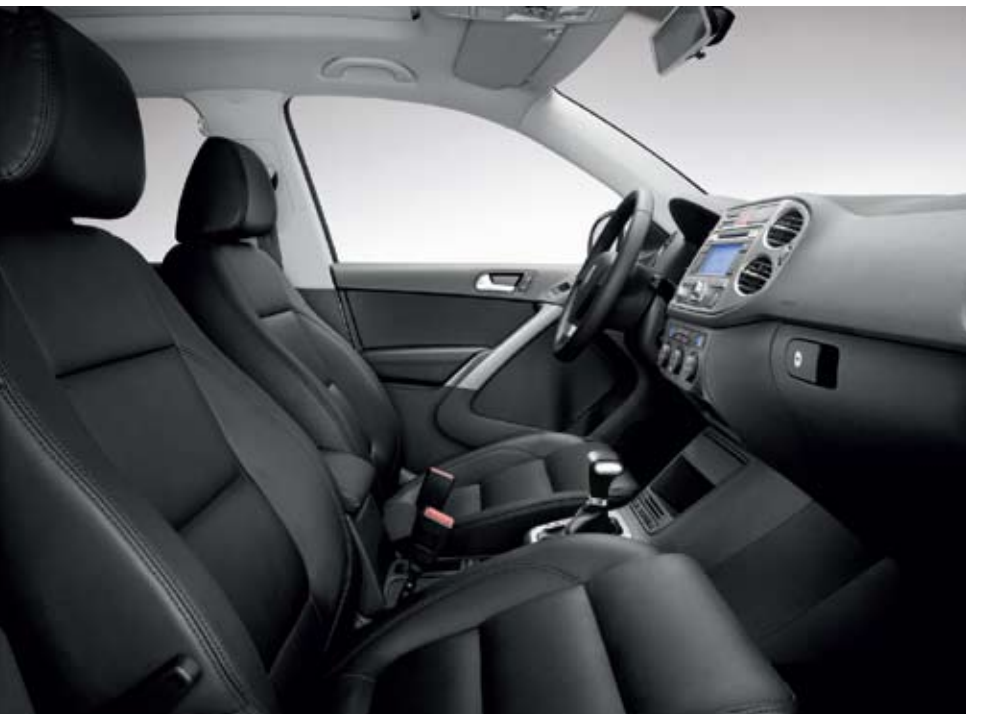
Black Vienna leather shown.