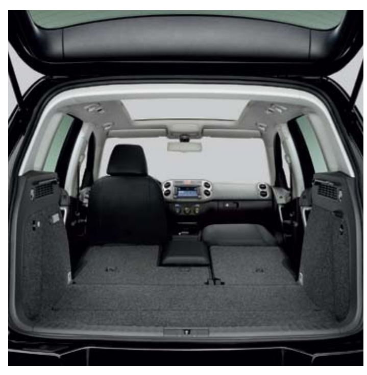
European models shown.