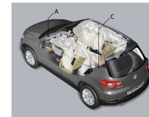
Optional rear side airbags shown.