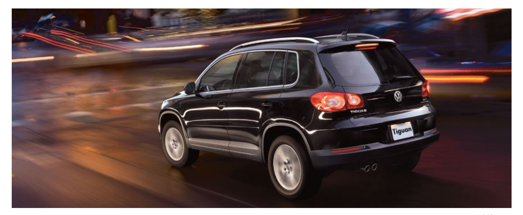
Drivers should always exercise care and control and drive according to weather and road conditions.

*Your vehicle is sold equipped with all-season tires. However, please remember that the use of winter tires may be mandatory in your province or territory. Make sure your vehicle has the proper tires at all times. Always drive according to road and weather conditions.