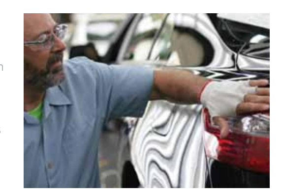
THE HUMAN TOUCH. As impressive as the machinery is, the achievement of perfect fit and finish is also the result of continuous human touch for every step of the way.

PROCESS is one that is constantly evolving. With our "Just-In-Time" practice, the goal is to make certain that during the manufacturing process, only what is needed gets produced. The result is twofold: because there's no excess supply, any issues are exposed and promptly resolved to ensure that everything off of the Toyota assembly line is of exceptional quality.