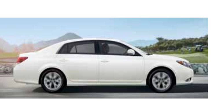
XLS shown in Blizzard Pearl.