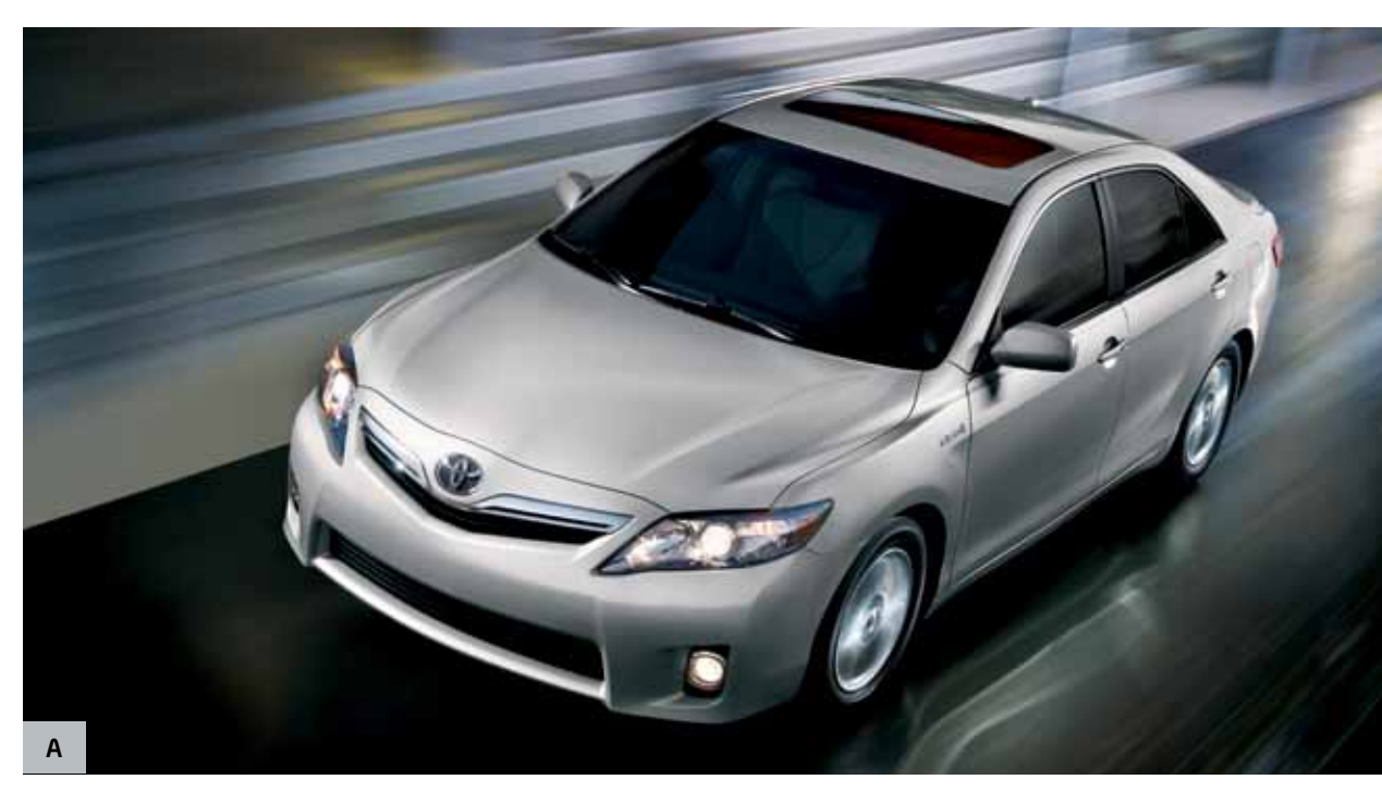
A. Camry Hybrid with Leather and Navigation Package shown in Classic Silver Metallic. B. Push Button Start, Smart Key System. C. Camry Hybrid cockpit. D. Available backup camera.

• Push Button Start, Smart Key System. • Power 8-way driver's seat and 60/40 split rear bench seat. • Optional DVD based navigation system<sup>5</sup> with 7-inch LCD