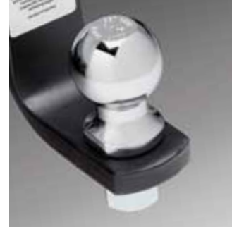
Towing Accessories Haul with confidence with a towing hitch.