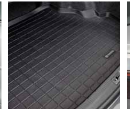
Cargo Liner Protect your interior with this durable vinyl liner which features a raised lip to contain spills for easy cleanup.