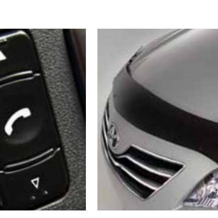
Bluetooth<sup>®4</sup> Keep your hands on the wheel and your eyes on the road as you talk conveniently and safely through the Bluetooth®4 hands free system.