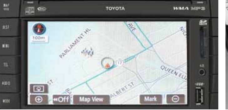
Navigation System<sup>5</sup> Find any destination with the push of a button.

Rear Bridge Spoiler Rear Lip Spoiler Remote Engine Starter Security System Side Window Visors Towing Accessories