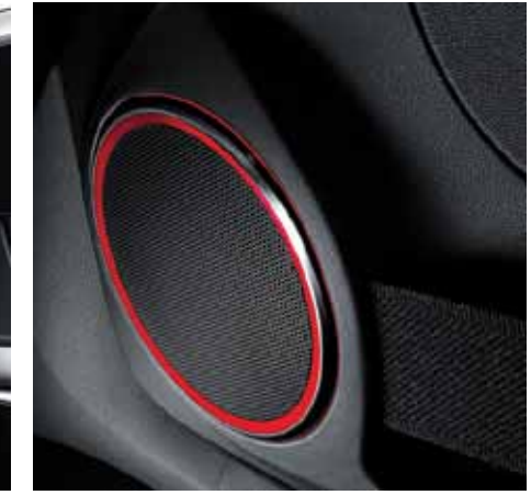
Ambient lighting feature*

A 400-watt masterpiece created specifically for Volkswagen by one of the most legendary names in music.