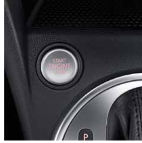
KESSY keyless access with start and stop button*

Get into your Beetle and get on the road without having to dig around for your key.