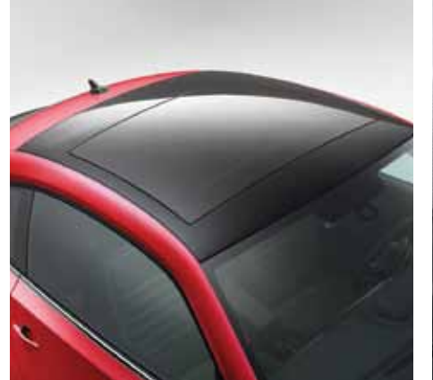
Available panoramic power sunroof

Spoil yourself even more with an integrated rear spoiler that enhances the look of the 2012 Beetle.