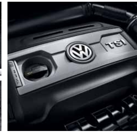
Available 2.0 TSI turbocharged engine with 200 horsepower and 2.5L engine with 170 horsepower

Get into your Beetle and get on the road without having to dig around for your key.