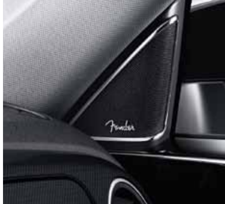
Fender® premium audio system*

The panoramic, power-sliding sunroof gives a whole new meaning to the term "open road".