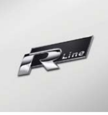
Available R-Line If you're wondering why it's so hard to tear your eyes away, it might be the combination of aesthetics and luxury of the R-Line Package.