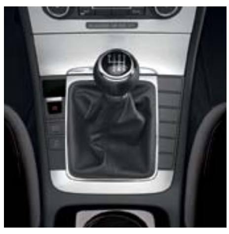
2.0 TSI engine with 200 horsepower and 3.6 FSI engine with 280 horsepower

Powerful and efficient, these engines offer something special for every driver.