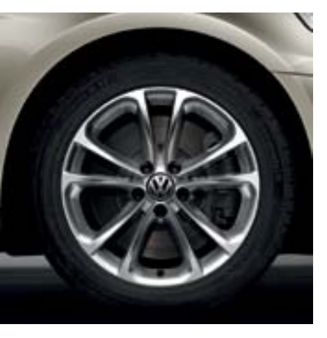
17" alloy wheels Cast your eyes on the 17" alloy wheels. Careful, though – you might not be able to look away.

Like everything else on the CC, we took comfort a step further. More ways to adjust your sport seat means more ways to perfectly tailor it to where you feel most comfortable.