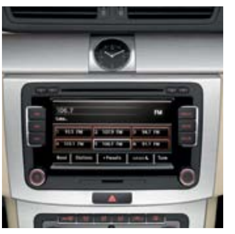
Premium 8 touch screen radio So much fun right at your fingertips – literally. This touch-screen unit, with 6-disc CD changer, gives you all the music you could possibly want, in one sleek, powerful package.