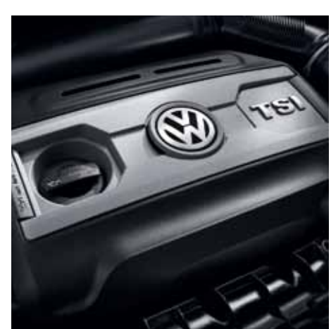
2.0 TSI 200-horsepower engine This award-winning turbocharged engine has 200 horsepower and 207 lb-ft of torque. In plain English, it's fast. And powerful.

In every way, our lights go farther. Not only brighter than regular bulbs, the Bi-Xenon lights with AFS turn up to 13 degrees around corners before you do. On top of that, the LED Daytime Running Lights last significantly longer than traditional headlights.