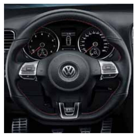
Multifunction GTI sport steering wheel with available DSG paddle shifters With the Golf GTI's leather-wrapped multifunction sport steering wheel, you'll never want to let it go.