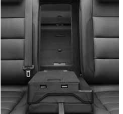
60/40 split-folding rear seats with centre armrest and pass-through

Take all of your tunes with you. Just plug in the MDI with iPod® adapter to easily access all of your music via the in-dash touch screen.