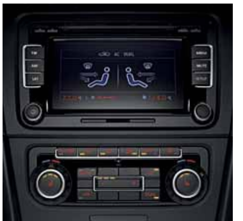
Climatronic® dual-zone electronic climate control*

Fit even larger items in an already large 1.89 cubic metres of cargo space with easy access either through or on top of the folded rear seats.