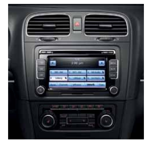
Premium 8 touch-screen radio*

So much fun right at your fingertips – literally. This touch-screen unit, with 6-disc CD changer, gives you all the music you could possibly want, in one sleek, powerful package.