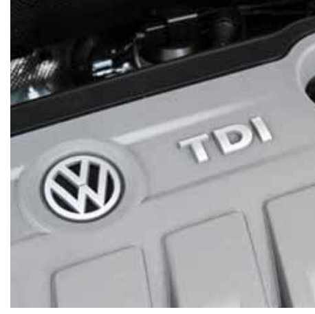
Available TDI Clean Diesel engine

So much fun right at your fingertips – literally. This touch-screen unit, with 6-disc CD changer, gives you all the music you could possibly want, in one sleek, powerful package.