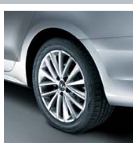
17" alloy wheels* Cast your eyes on the 17" alloy wheels. Careful, though – you might not be able to look away.