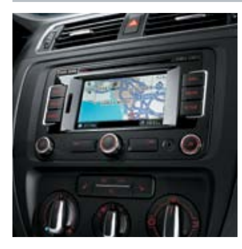
Available RNS 315 navigation system This rarely-seen-in-this-class feature will get you wherever you're going and back home again, without a single "I think it's a left?"