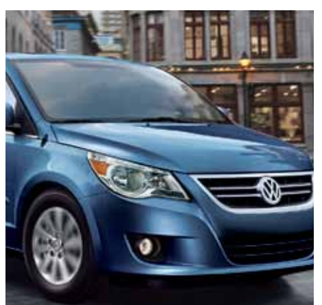
3.6L 283-horsepower engine with 6-speed automatic transmission

Unbelievably convenient – start your car without ever having to take your key out of your pocket.