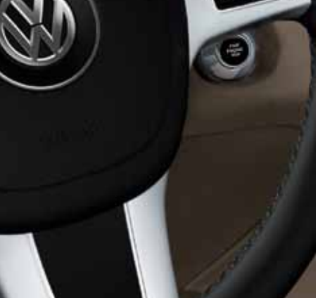
Keyless entry with start and stop button

Your second-row seats move effortlessly when you need more leg room or more storage space.