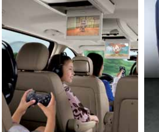
Available Rear Seat Entertainment (RSE)

Every passenger can keep their cool – or their heat – with three individually controlled climate zones.