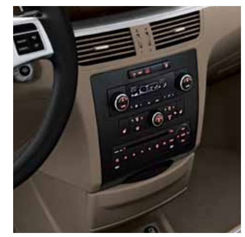
3-zone climate control

Every passenger can keep their cool – or their heat – with three individually controlled climate zones.