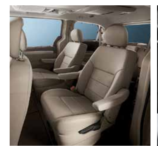
Sliding second-row captain's chairs

Cast your eyes on the 17" alloy wheels with all-season tires. Careful, though – you might not be able to look away.