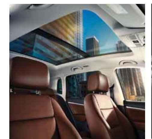
Panoramic power sunroof*

The path to your destination, or your parking spot, will be just as clear as the music piping out of the speakers with the available Technology Package in your 2012 Tiguan.