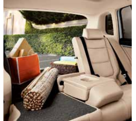
60/40 split-folding and sliding rear seats for maximum versatility

Cast your eyes on these 19" alloy wheels. Careful, though – you might not be able to look away.