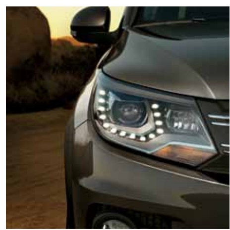
Available Bi-Xenon headlights with AFS and LED Daytime Running Lights

The panoramic, power-sliding sunroof gives a whole new meaning to the term "open road".