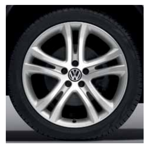
Available 19" alloy wheels on Highline Sport Package

This award-winning turbocharged engine has 200 horsepower and 207 lb-ft of torque. In plain English, it's fast. And powerful.