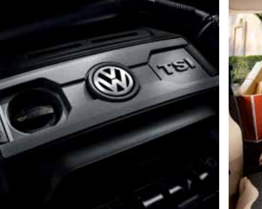
2.0 TSI engine with impressive 200 horsepower and 207 lb-ft of torque

In every way, our lights go farther. Not only brighter than regular bulbs, the Bi-Xenon lights with Adaptive Front-light System turn up to 13 degrees around corners before you do. On top of that, the LED Daytime Running Lights last significantly longer than traditional headlights.