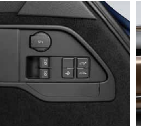
Power rear seat backrest release*

The panoramic, power-sliding sunroof gives a whole new meaning to the term "open road".