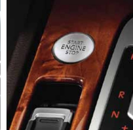
KESSY keyless access with start and stop button*

In every way, our lights go farther. Not only brighter than regular bulbs, the Bi-Xenon lights with Adaptive Front-light System turn up to 13 degrees around corners before you do. On top of that, the LED Daytime Running Lights last significantly longer than traditional headlights.