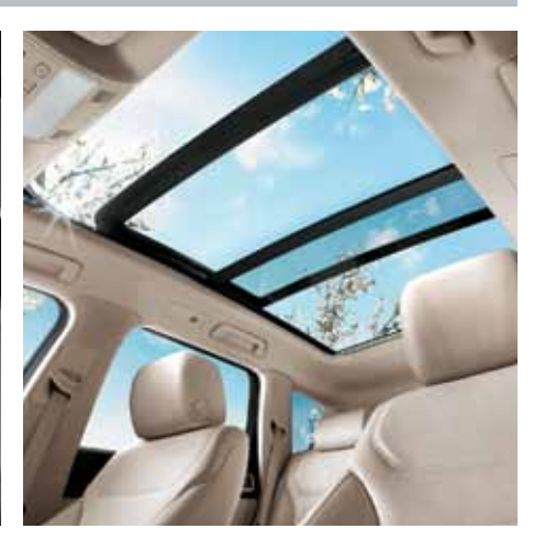
Available panoramic power sunroof

Whether you're in a hurry or simply have your hands full, KESSY keyless access allows you to unlock the doors without having to reach for your key.