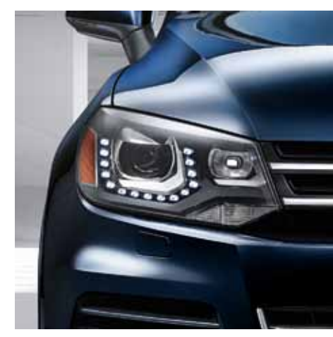
Available Bi-Xenon headlights with AFS and LED Daytime Running Lights

In every way, our lights go farther. Not only brighter than regular bulbs, the Bi-Xenon lights with Adaptive Front-light System turn up to 13 degrees around corners before you do. On top of that, the LED Daytime Running Lights last significantly longer than traditional headlights.