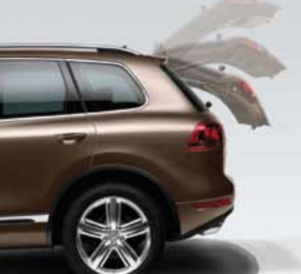
Available power tailgate with remote open and close function

Go-go-gadget bigger trunk. Lower your rear seats with the simple push of a button from the rear cargo area.