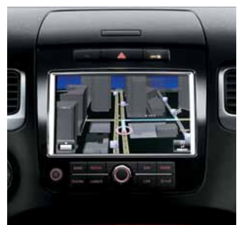
Standard RNS 850 navigation with voice control and 3-D map display

With its remote open and close function, getting into the Touareg's spacious trunk couldn't be any easier.