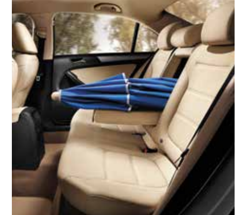
Best-in-class rear cargo space** with available pass-through*

Take all of your tunes with you. Just plug in the MDI with iPod® adapter to easily access all of your music.