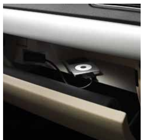
Media Device Interface (MDI) with iPod® connectivity*

Cast your eyes on the 17" alloy wheels. Careful, though – you might not be able to look away.