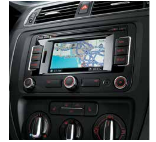
Available RNS 315 navigation system*

This rarely-seen-in-this-class feature will get you wherever you're going and back home again, without a single "I think it's a left?"