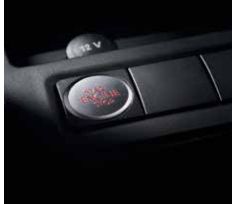
KESSY keyless access with start and stop button*

0.44 cubic metre (15.5 ft³) of trunk space gets even bigger when you fold down the 60/40 split rear seats or use the convenient rear-centre armrest pass-through.