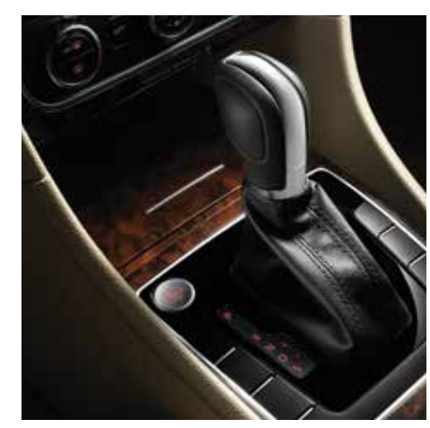
KESSY keyless access with start and stop button*

Unbelievably convenient – unlock and start your car without ever having to take your key out of your purse or your pocket.