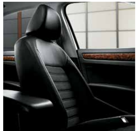
Leather/Dinamica seating surfaces*

Unbelievably convenient – unlock and start your car without ever having to take your key out of your purse or your pocket.