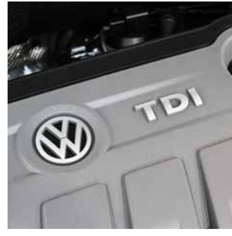
Three impressive fuel-efficient engines

The richness of leather combined with premium, sport-inspired insets.