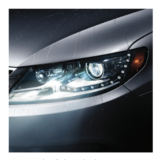
Bi-Xenon headlights with Adaptative Front-Light System (AFS)

Your favourite song is at your fingertips. This touch-screen unit gives you all the music you could possibly want, in one sleek, powerful package.