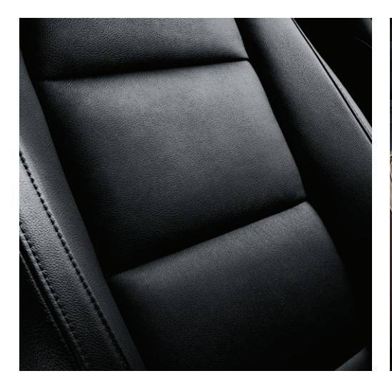
Leather sport seats*

Unbelievably convenient – start and unlock your car without ever having to take the key out of your pocket.