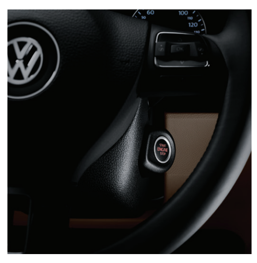
KESSY keyless access with push-button start*

Plug in your iPod ^{\textcircled{\$}} and cruise the open road with all your favourite tunes.