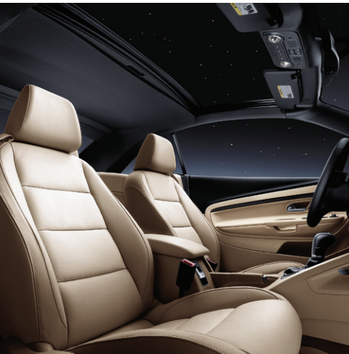
Coupe-Sunroof-Convertible (CSC) automatic folding hardtop

To keep you comfortable and in control while driving, side-bolstered leather seats support the contours of your body.