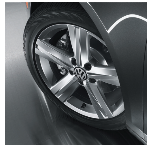
17" alloy wheels

Go from coupe to convertible in 25 seconds flat.