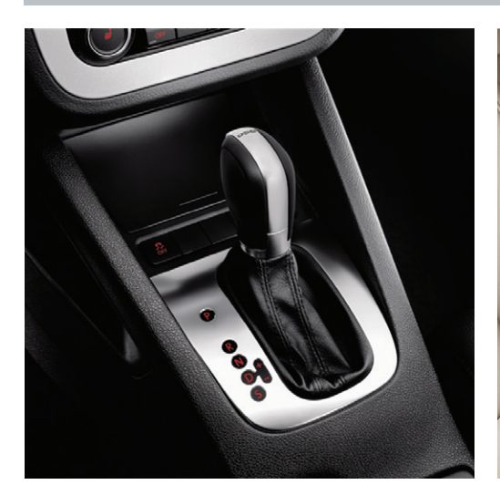
6-speed automatic DSG with Tiptronic®

Shifts gears seamlessly in 4/100ths of a second. Or, quite literally, in the blink of an eye.