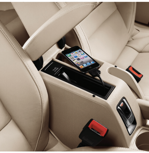
Media Device Interface (MDI) with iPod® adapter

Shifts gears seamlessly in 4/100ths of a second. Or, quite literally, in the blink of an eye.