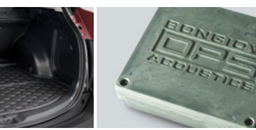
Bongiovi Acoustics DPS