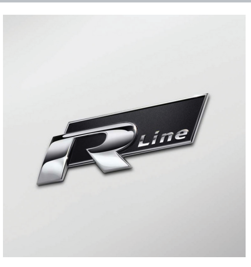
Available R-Line* Try to look away from the show-stopping aesthetics of the R-Line Package.