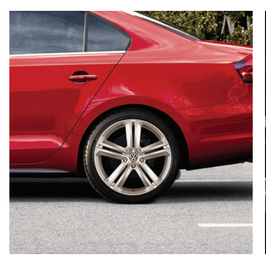
Available 18" Mallory alloy wheels* When you add 18" alloy wheels to your GLI, you're adding some serious style. Expect to be stared at.