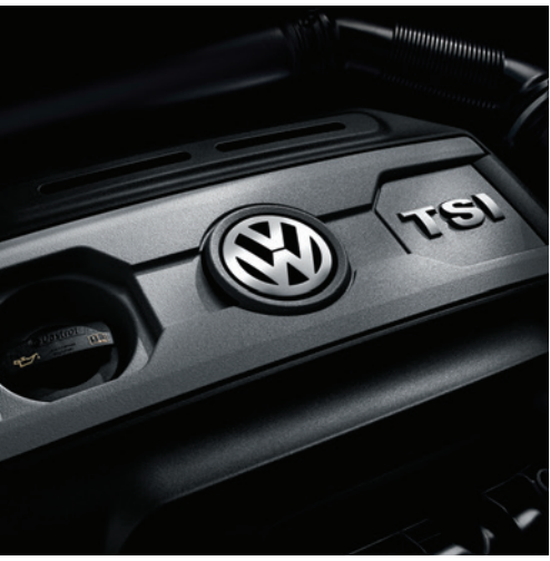
2.0 TSI engine with 210 hp The responsive 2.0 TSI turbocharged engine delivers a full 207 lb-ft of torque at just 1,700 rpm. The perfect mix of power and driveability.