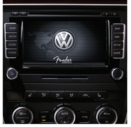
Available Fender® Premium Audio System*

No matter where the finish line is, always find your way back with the Jetta GLI's touch screen navigation system.