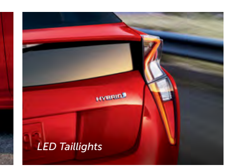
FRONT COVER Prius Touring shown in Hypersonic Red.