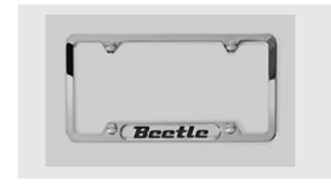
Licence plate frame