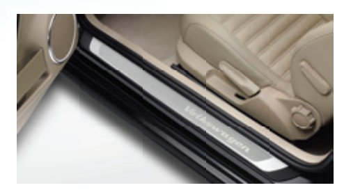
Door sill protection trim with logo