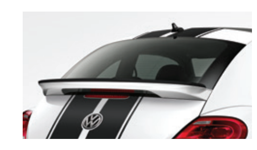
Hatch top spoiler