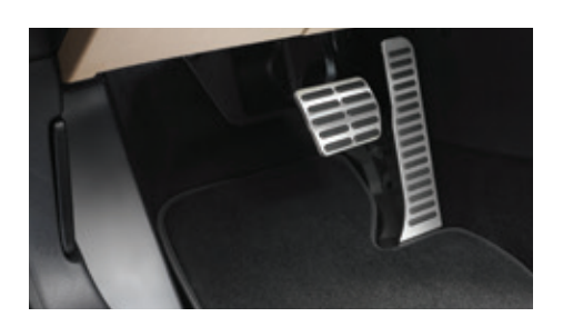
Sport pedal cap set