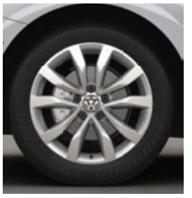
16" Propeller steel wheel 17" Rotor alloy wheel CL