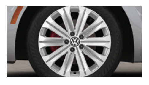
18" Spokane wheel