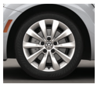
16" Whirl alloy wheel TL+ Convenience Package