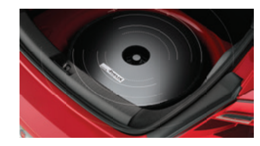
Spare tire subwoofer