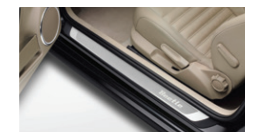
Door sill protection trim with logo