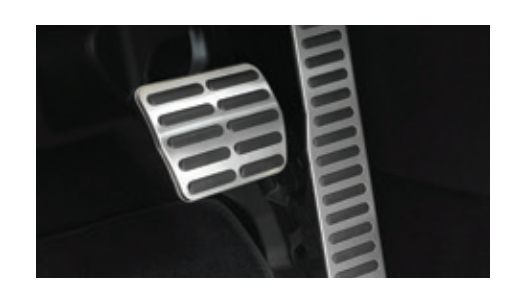
Sport pedal cap set