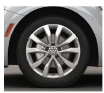
17" Rotor alloy wheel