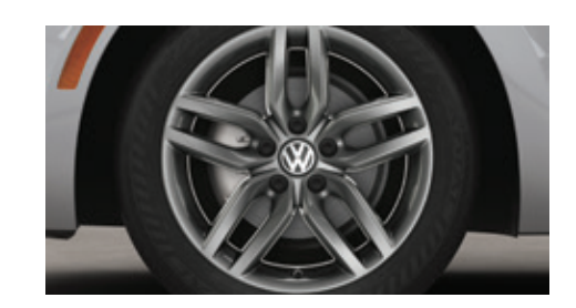
17" Helix wheel