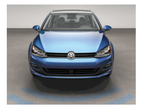
Available Park Assist**

Go ahead, try and fit in that spot. Sensors in the front and rear of the car will indicate if you're getting too close to