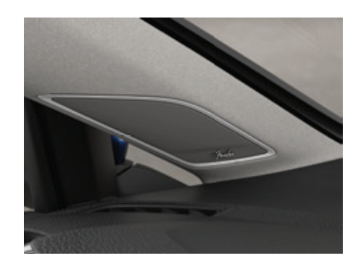
Available Fender<sup>®</sup> Premium Audio System

Connect to the things that matter most. The intuitive interface and voice command actions let you easily search online for songs, directions or even your favourite restaurant. So you'll keep your eyes on the road, and not on your screen.