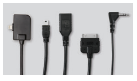
USB to Apple<sup>®</sup> Lightning connector