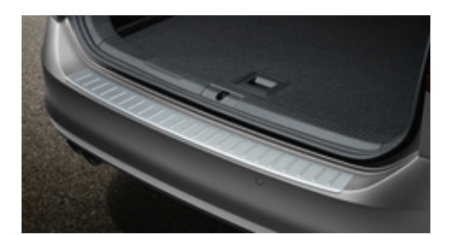
Rear bumper protection plate