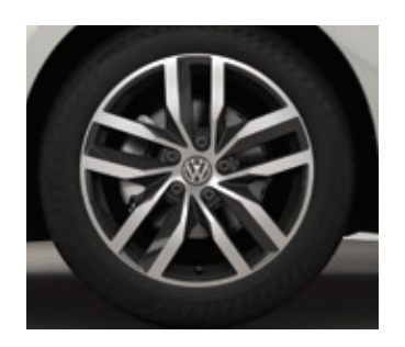
17" Madrid alloy wheel