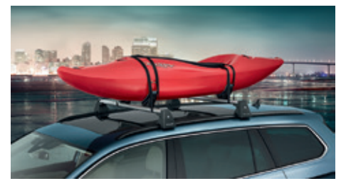
Base carrier bars and kayak holder attachment