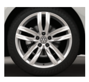
18" Durban alloy wheel