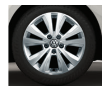
16" Toronto alloy wheel TL