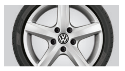
15" Aspen wheel