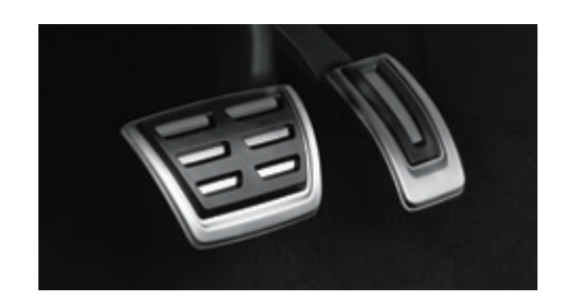
Sport pedal cap set