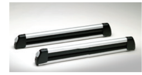
Base carrier bars and snowboard/ ski attachment