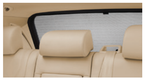
Rear and hatch window sunshades