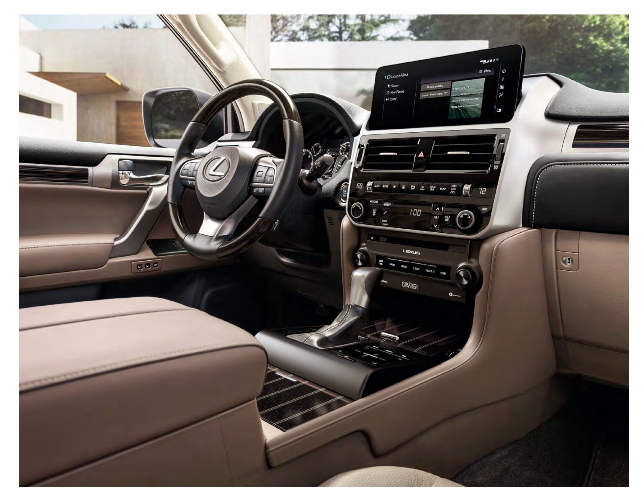
\mathsf{GX}\ \mathsf{shown}\ \mathsf{with}\ \mathsf{Sepia}\ \mathsf{semi-aniline}\ \mathsf{leather}\ \mathsf{and}\ \mathsf{Gray}\ \mathsf{Sapele}\ \mathsf{wood}\ \mathsf{with}\ \mathsf{Aluminum}\ \mathsf{interior}\ \mathsf{trim}