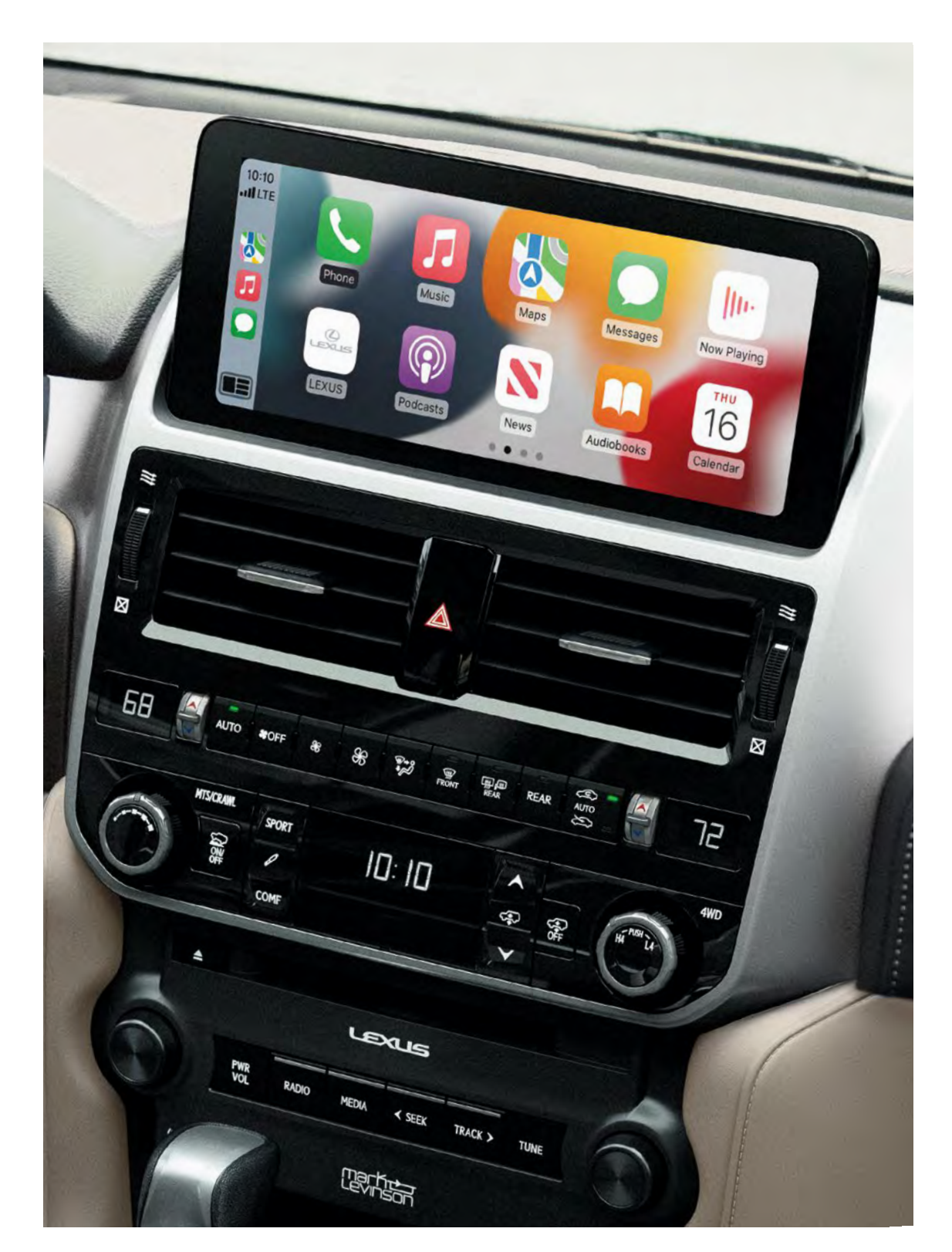
GX shown with Apple CarPlay integration and Ecru semi-aniline leather and Gray Sapele wood with Aluminum interior trim