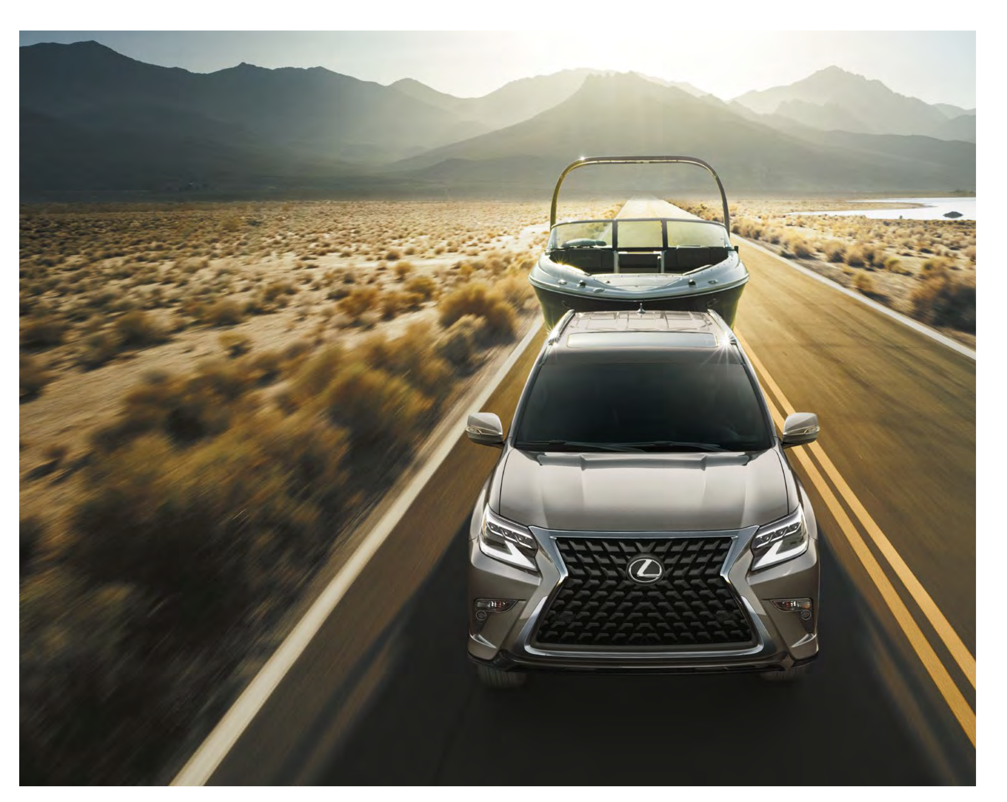
GX shown in Atomic Silver