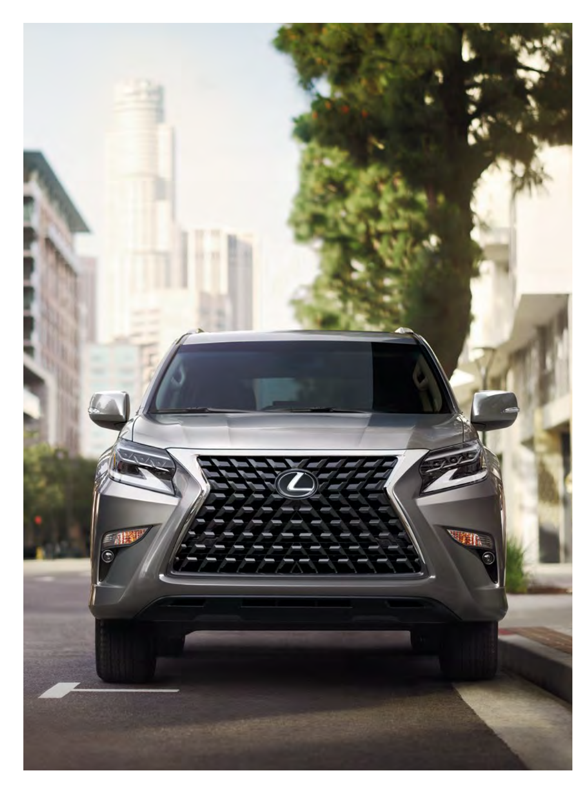
GX shown in Atomic Silver