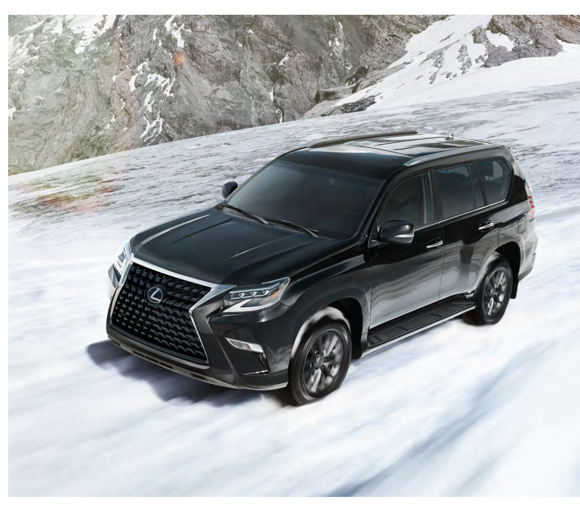
GX shown in Caviar