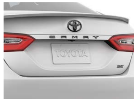
Blackout emblem overlays