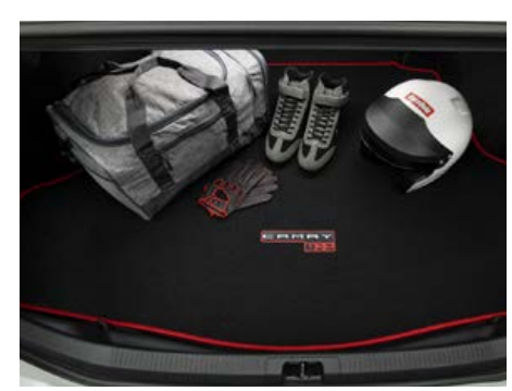
TRD carpet trunk mat