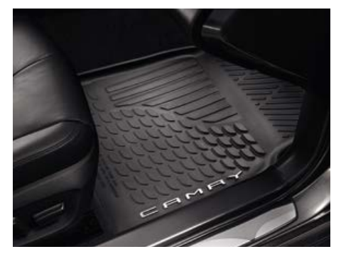
All-weather floor liners<sup>43</sup>

This is a great way to add extra personality to your Camry. Not every accessory is available in your area, so for a complete list of accessories, go to toyota.com/camry/accessories.