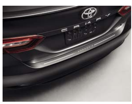
Rear bumper appliqué