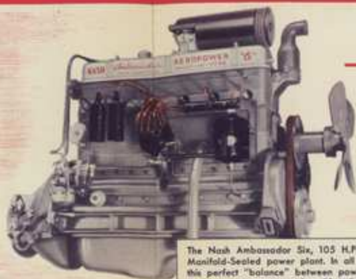
The Nash Ambassador Six, 105 H.P., Twin Ignition, Valve-in-Head, Manifold-Sealed power plant. In all America none but Nash offers this perfect "balance" between power, performance and economy. Rocketing pick-up from 15 to 50 M.P.H. in 11 seconds flat, high gear! The Nash Ambassador Aerpower Eight is 115 H.P. . . . a performance marvel in any company and the most economical "fine car" ever built.