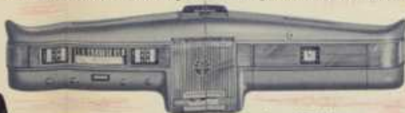
Handsome instrument panels of both Ambassador Six and Eight keynote modern design and functional groupings of operating buttons and dials.

(All above models available in "Six" and "Eight" series except Business Coupe, which is available in "Six" series only.)