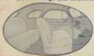
The popular new Coupe Brougham has full-width comfort seats both front and rear . . . and oversize luggage compartment behind.