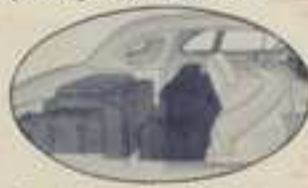
The Ambassador Six Business Coupe provides 27 1/2 cubic feet of space in the rear deck plus huge auxiliary space behind the seat.