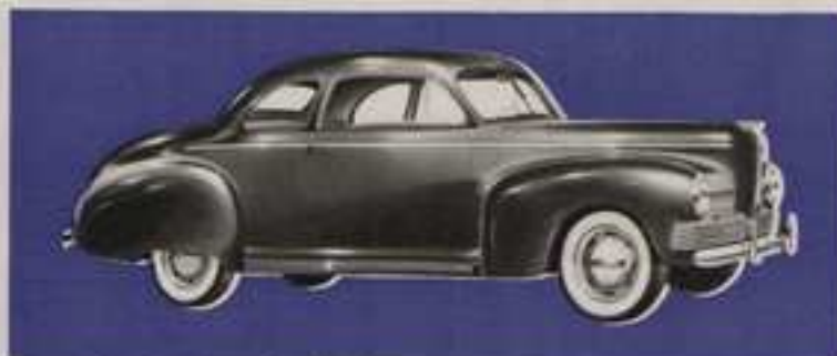
The Nash Ambassador "600" Coupe. One of the most inexpensive cars on the road today—but perfectly suited for the young executive, whose success depends upon appearance. An ideal "town" or "exec" car for the suburban family.