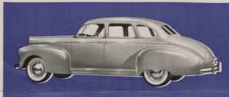
The Nash Ambassador "600" Four-Door Trunk Sedan. All the style and room and luxury of a high-priced car—yet priced with the lowest. Complete with de luxe appointments. A big car, a car you'll be proud to own.