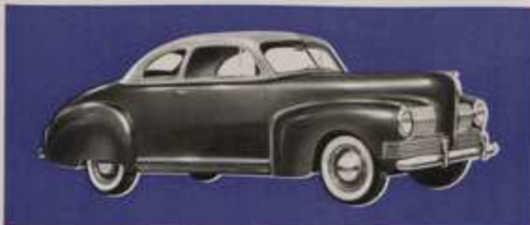
The Nash Ambassador "600" Two-Door Coupe Brougham. Another great style leader in the lowest-price field. Its six-passenger roominess and two-door safety are much appreciated by persons of small active children.