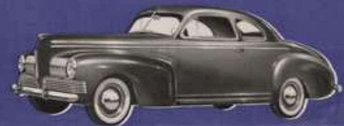
The Nash Ambassador Eight Two-Door Coupe Brougham. Smart as a sport coupe—yet it has the dignity of a full-size sedan. An informal, intimate car for town and country use. Impressively styled in keeping with the Nash Ambassador tradition.