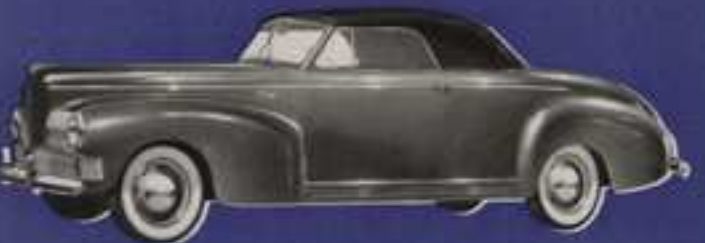
The Nash Ambassador Six Convertible Coupe. Equipped with convenient automatic top... America's most thoroughly enjoyable car. Special colors and upholstery make it the most luxurious low-price convertible you can own.