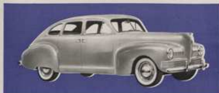
The Nash Ambassador "600" Four-Door Slipstream Sedan. Truly the most beautiful, low-priced car on the road today—this de luxe Nash sedan offers the utmost in comfort, luxury, and economy to motoring America.

75 H.P. Flying Scot Engine—194" Overall Length