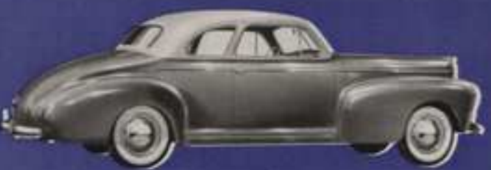
The Nash Ambassador Six Coupe. The ideal car for the business or professional man. Its beautiful styling and superior riding qualities make it a popular "exec" car in families, too. Extra large compartment for luggage or business use.