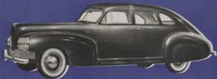
The Nash Ambassador Six Four-Door Slipstream Sedan. Commanding in appearance, as well as in performance—this is a popular car in every smart circle. So beautifully designed inside and out, it is difficult to imagine it's so reasonably priced.

105 H.P. 6-Cylinder, Twin-Ignition Valve-in-Head Engine—with 7-Bearing Crankshaft... 121-inch Wheelbase. Five Models