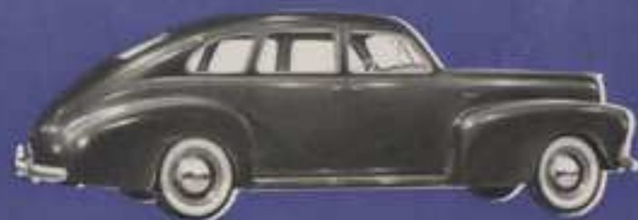
The Nash Ambassador Eight Four-Door Slipstream Sedan. A companion in style to the model below—but distinguished by the added grace of Nash's slipstream sculptured back. A Nash that can proudly take its place among the world's best cars.

115 H.P. 8-Cylinder, Twin-Ignition Valve-in-Head Engine—with 9-Bearing Crankshaft... 121-inch Wheelbase. Four Models.