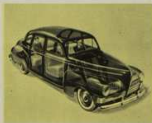
A NEW KIND OF BODY—SAFER AND STRONGER! Built on the structural principles of the streamlined train and stratoliner plane—Nash offers a new "unitized" body—one solid, welded web of steel.

that feeling of flying is the Fourth Speed Forward at work.