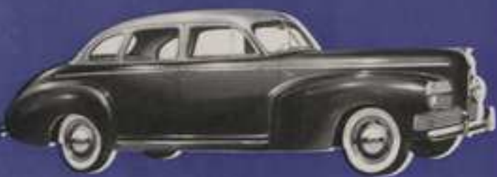
The Nash Ambassador Six Four-Door Trunk Sedan. A six-cylinder automatic built with the power, the size and the smoothness of most "eights," this sunningly-nyed Nash sedan rivals small light cars in gasoline and oil economy.