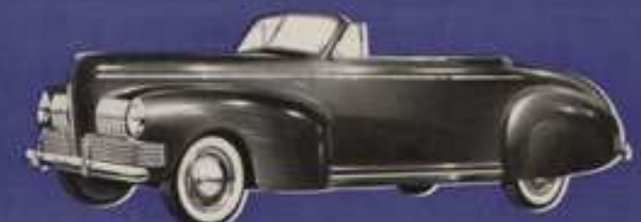
The Nash Ambassador Eight Convertible Coupe. For the young in heart, "Country Club" sportster with the superb power and all the luxurious appointments of a Nash. Equipped with automatic top that raises or lowers in 12 seconds.