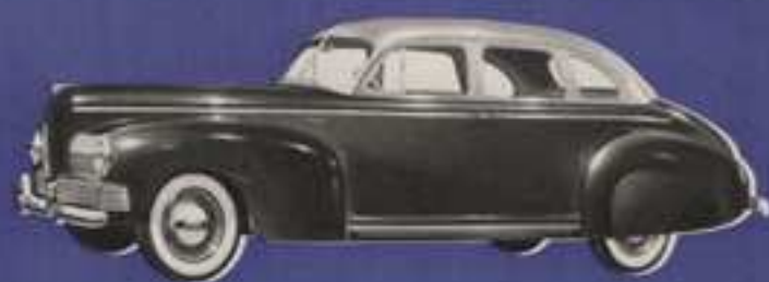
The Nash Ambassador Eight Four-Door Trunk Sedan. The most luxurious motoring Nash offers today. Designed throughout with master craftsmanship rarely approached in a mass car before. Reflects 25 years of quality manufacturing standards.