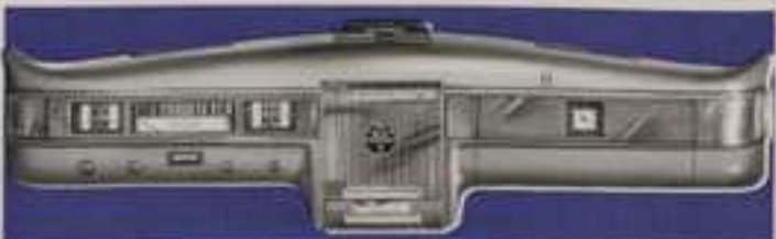
THEIR BEAUTY BEFORE YOU! —is Nash's gleaming smart new instrument panel. Designed by master craftsmen in harmonious with Nash's new luxurious Lounge Interior, it's decorated with rich chrome trim and indirect lighting of all instruments. An outstanding example of the fine quality workmanship that has distinguished Nash cars for 25 years.

You can today—why don't you see your nearest Nash dealer right now?