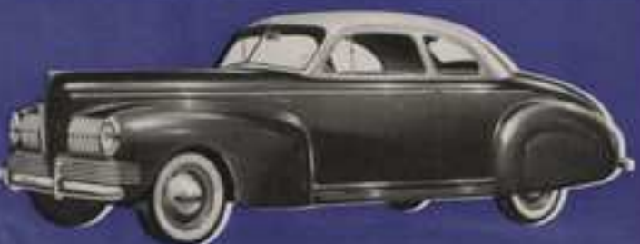
The Nash Ambassador Six Two-Door Coupe Brougham. The grace and distinction of a fine-quality Nash coupe for as little as you would spend for an ordinary car. Further proof that luxury is not necessarily available only at high prices.