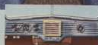
The Neapolitan Blue Custom Interior and matching instrument panel offer distinctive harmony with complementary exterior shades.