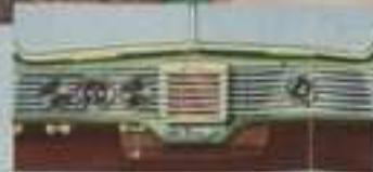
A distinctive new Sherwood Green, carried through instrument panel and interior trim, is one of the available new Custom Interior colors.