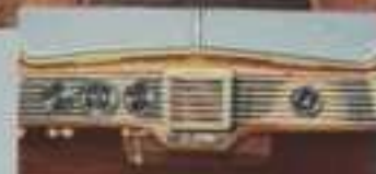
Among Custom Interior color choices is the rich, luxurious Temple Brown with handsome instrument panel colored to match perfectly.