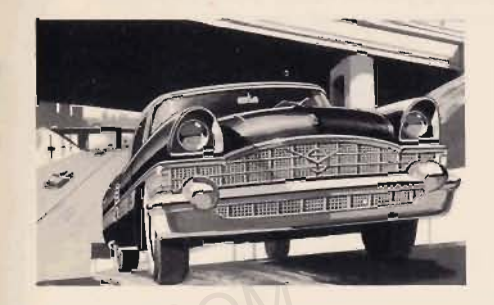
NO MORE slipping on icy inclines if either rear wheel can catch hold. Packard with Twin-Traction Safety Differential takes you up safely and surely.

NO MORE fear of getting stuck in the mud if either rear wheel can catch hold. Packard with Twin-Traction Safety Differential provides the grip where others slip.