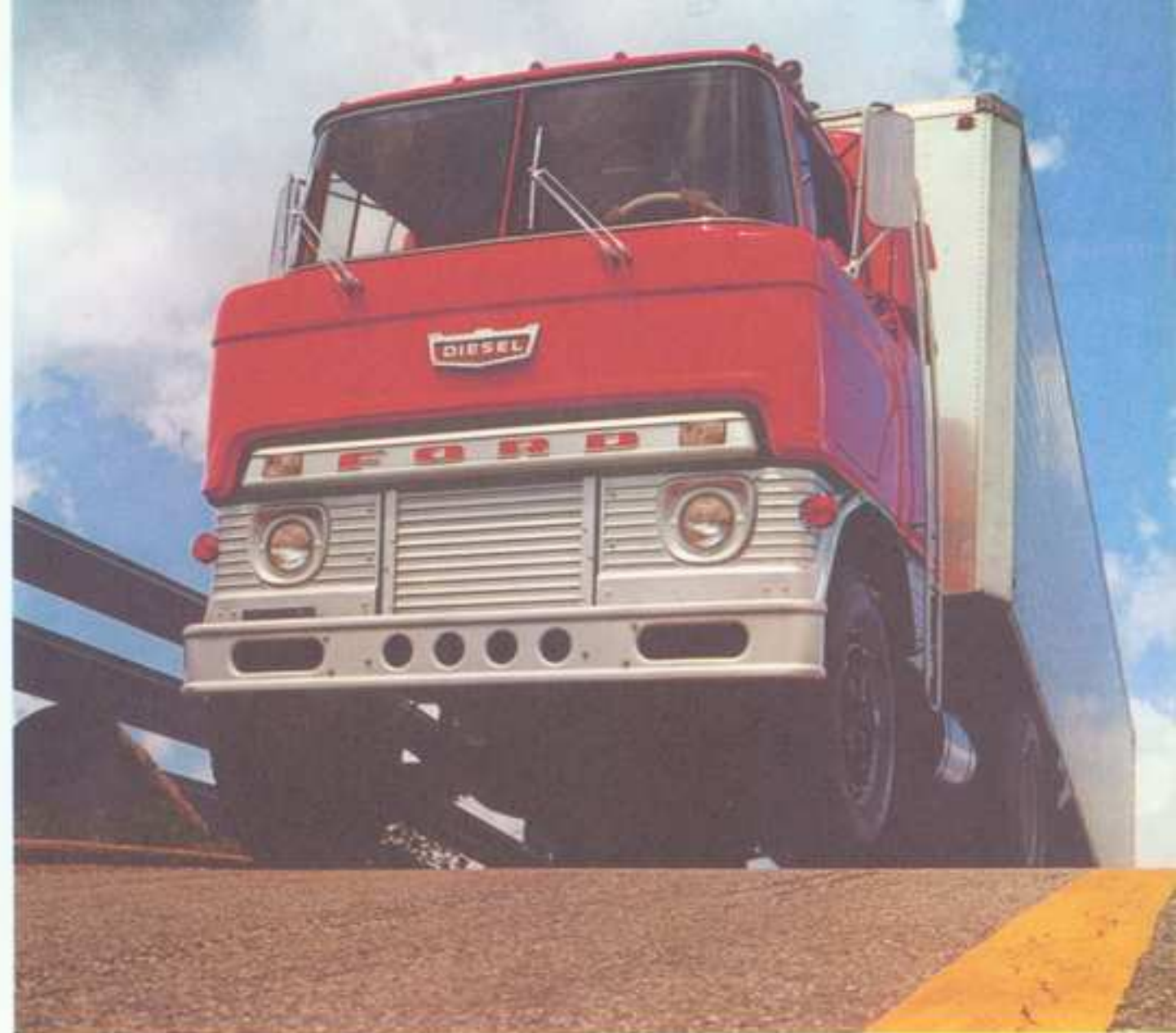
The rugged new “H” series of trucks is available with either diesel engines or Ford Super-Duty V-8 gasoline engines.

The light-duty Econoline series has three models—an eight-passenger station bus, a van and a pickup. They utilize many standard components from other Company products, including the 85 HP Falcon engine.