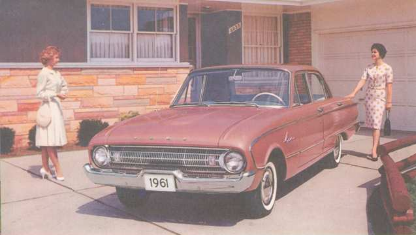
The optional deluxe trim and ornamentation package for the Falcon includes full length, bright metal, body side moldings.

With front seat fully forward, the loadspace in the Falcon station wagon measures 86 inches to the closed tailgate.