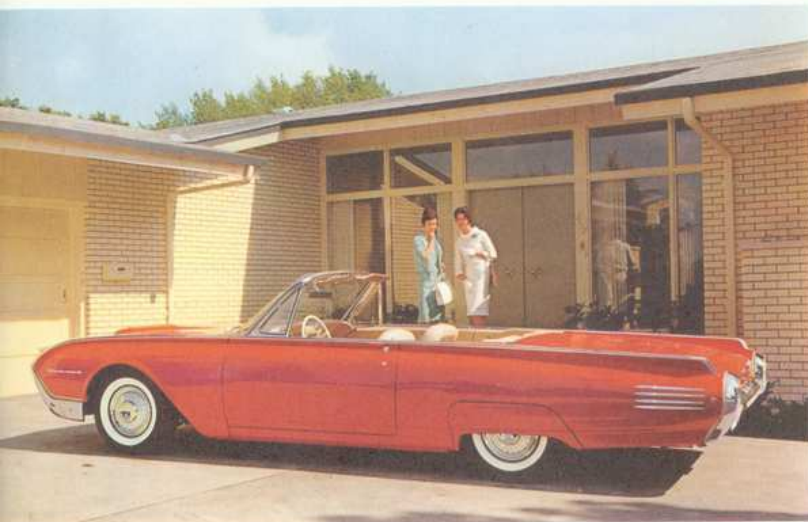
The top of the Thunderbird convertible retracts fully into the trunk through the use of a single control on the instrument panel.