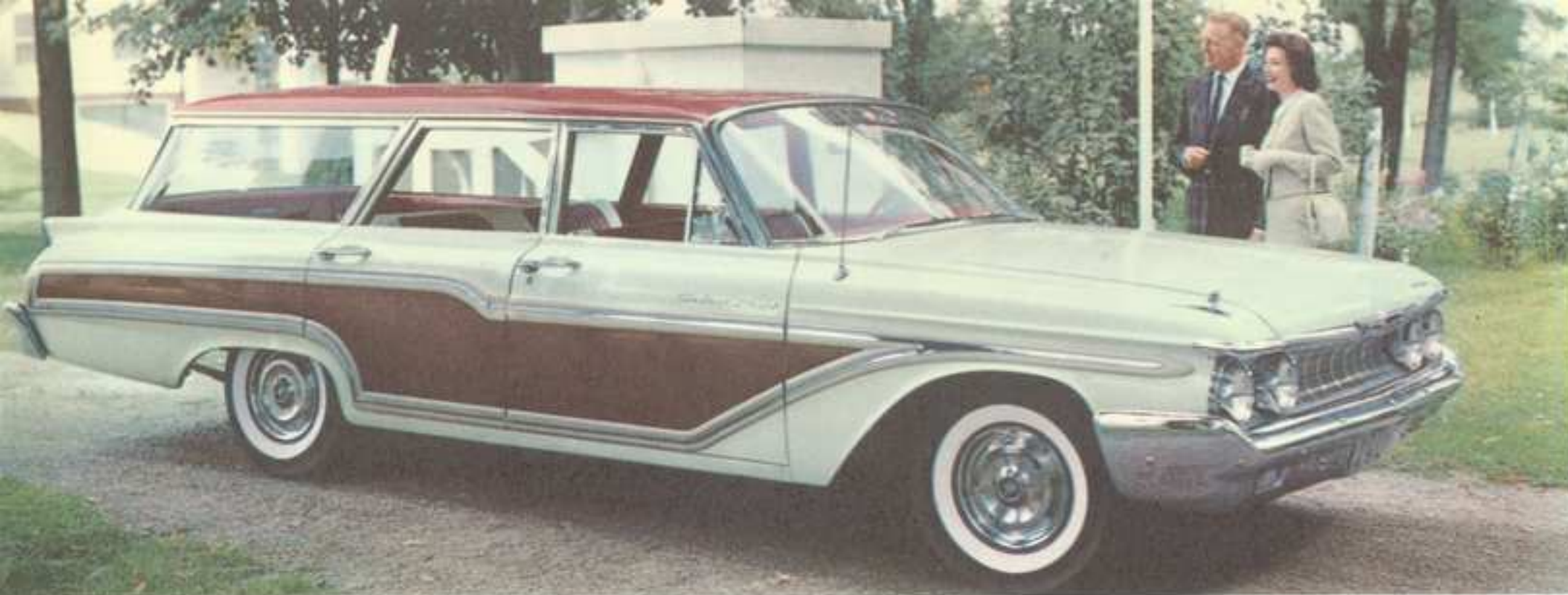
There are four Commuter and Colony Park station wagons in the 1961 Mercury car lines. Illustrated here is the Colony Park wagon.

The new Mercury weighs about 350 pounds less than the previous model. This lower weight, combined with new lower displacement engines, means an improvement in average operating economy. A lubrication interval of 30,000 miles will give the Mercury owner additional savings.