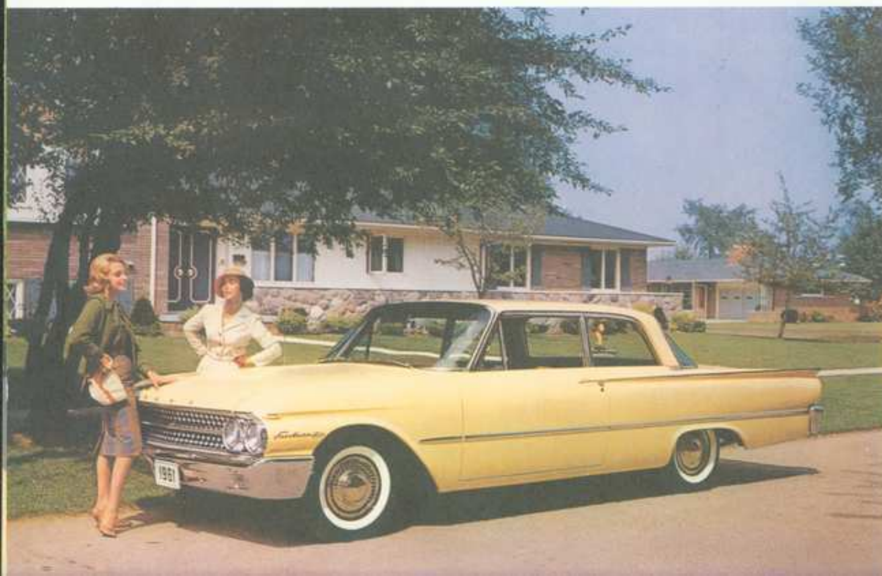
The Fairlane 500 series for 1961, here shown in the two-door model, is also available in a four-door sedan.