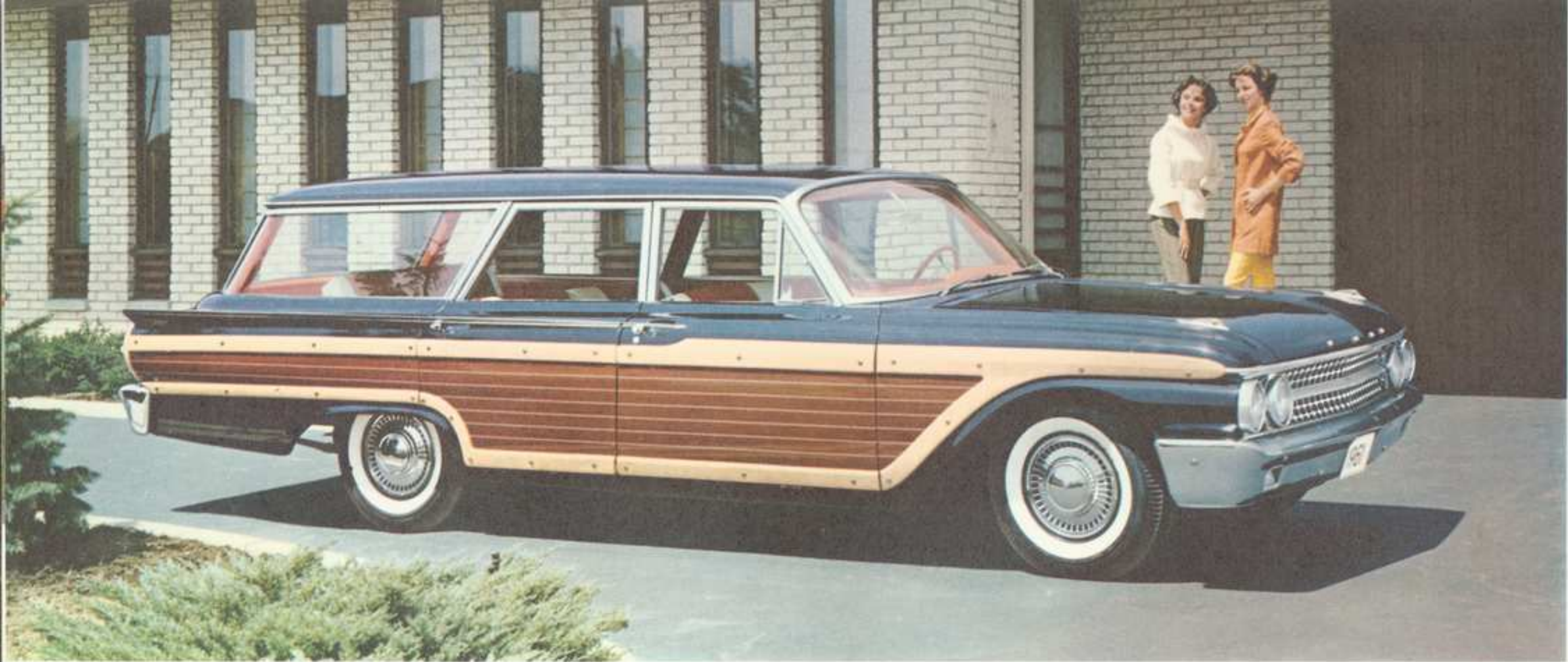
The Country Squire station wagons for 1961 are offered in six-passenger and nine-passenger models.