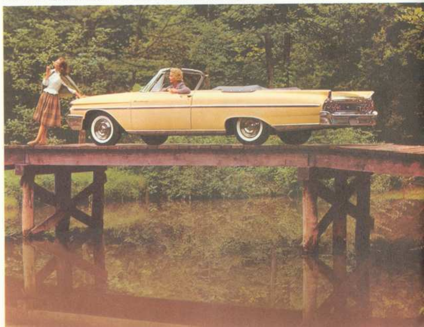
The Monterey convertible points up the distinctive styling of the new Mercurys for 1961.

Rubber body mounts are used to seal out road and engine noise. They prevent it from being transmitted into the car. The more rubber body mounts there are, the more effective the sound barrier becomes. In the Ford Family of Fine Cars, with more insulating body mounts, you get a remarkably quiet ride.