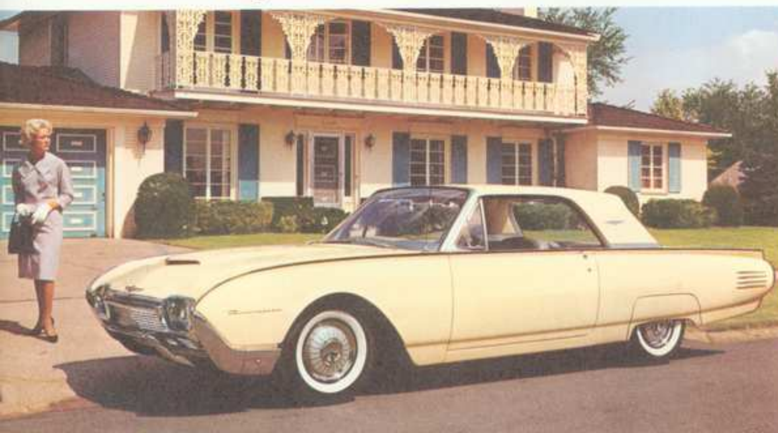
The 1961 Thunderbird introduces a new body and chassis, a new engine and new interior and exterior trim.