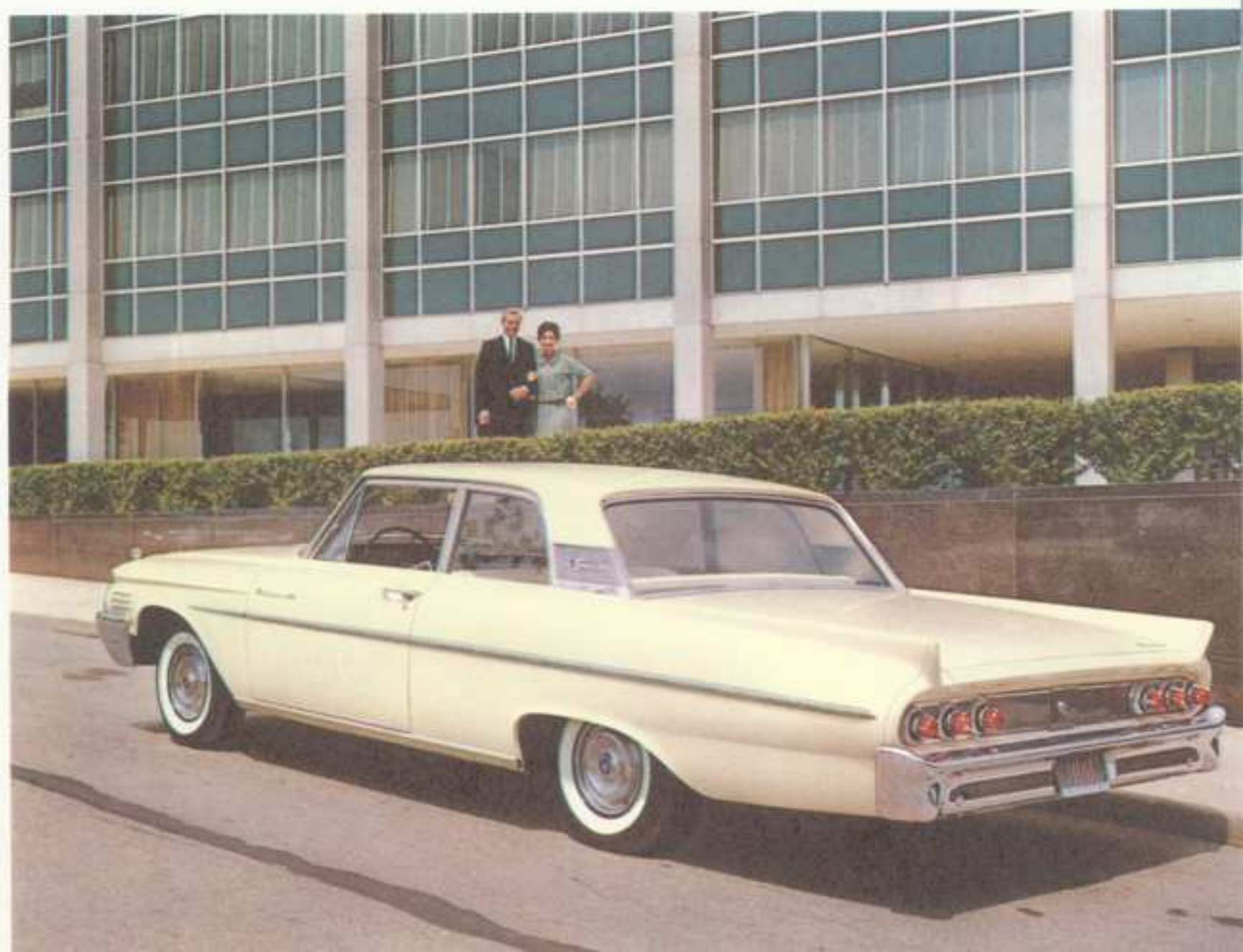
The 1961 Meteor "800" series presents two-door and four-door sedans and hardtops.

DIMENSIONS—Sedans: Wheelbase 120"; over-all length 214.6"; over-all width 79.6"; headroom, 38.2" front, 37.6" rear. Station Wagons: Wheelbase 120"; over-all length 214.4"; over-all width 79.6"; headroom, 39.2" front, 40.5" rear.