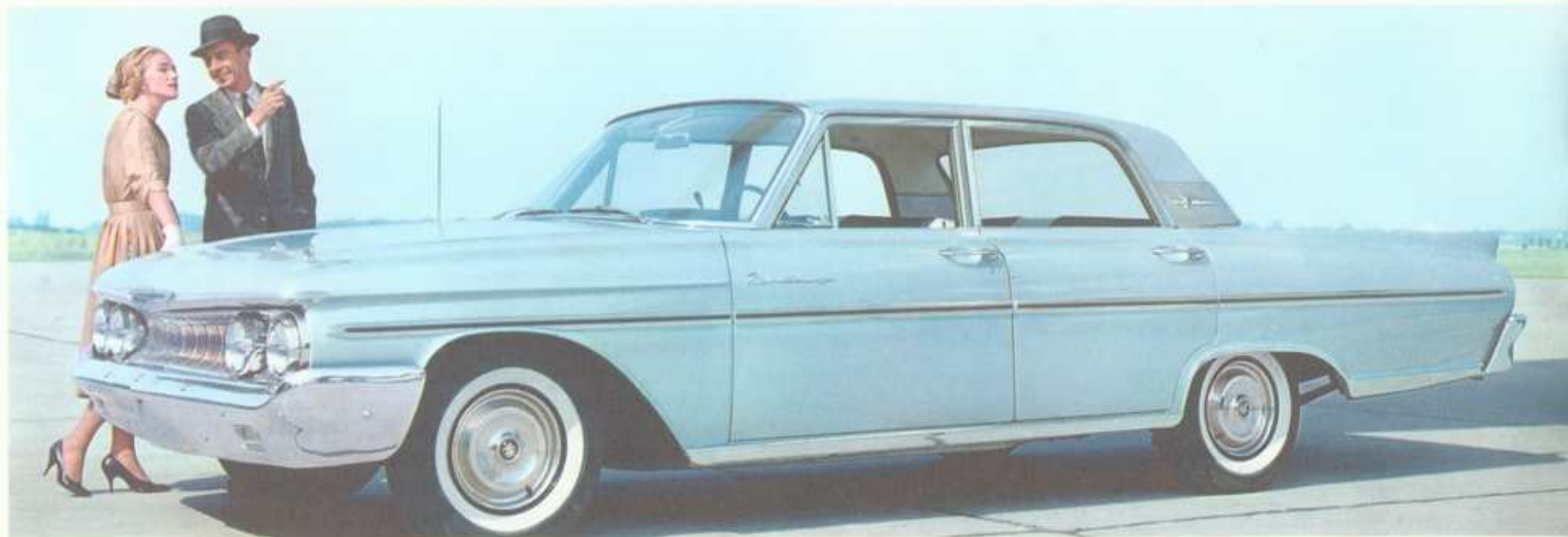
In addition to the convertible, two-door and four-door hardtops and a four-door sedan (pictured above) are available in the Monterey series.