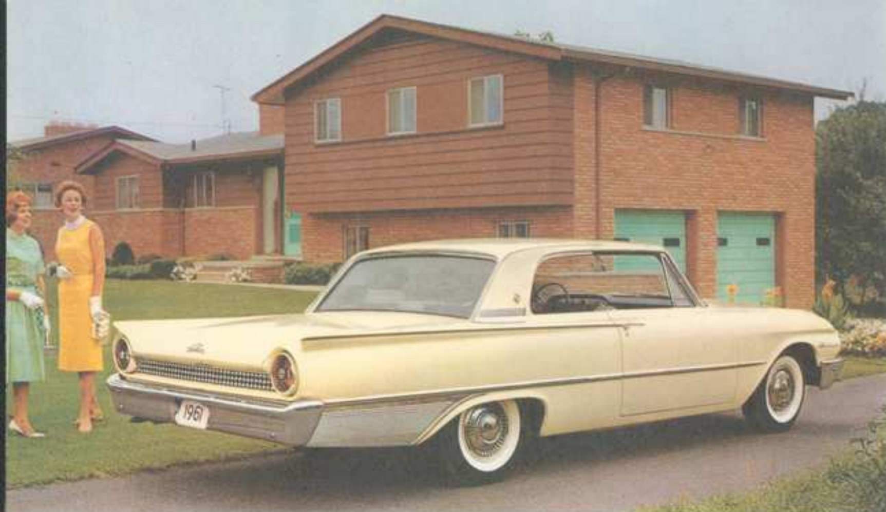
A two-door Club Victoria, introduced in 1961, is one of six body styles offered in the Galaxie series.