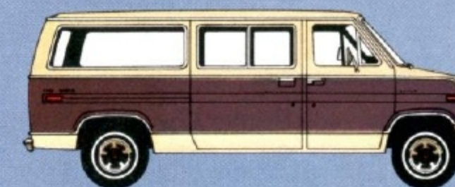
Center Accent Tu-Tone