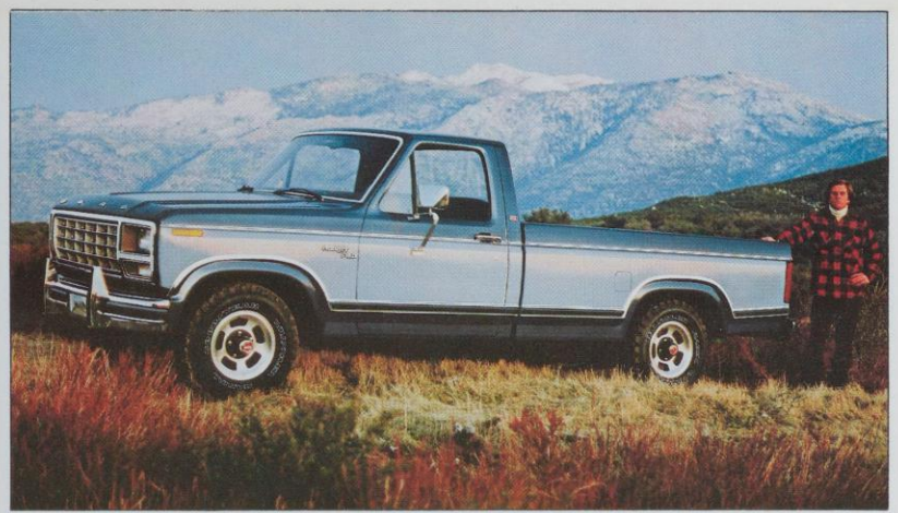
F-SERIES/ LIGHT TRUCKS

Ford. First new trucks of the 80's. They're new in looks, payloads and comfort. You get full function with payloads equal or greater than '79 models with comparable gross vehicle weight, full dimension pickup