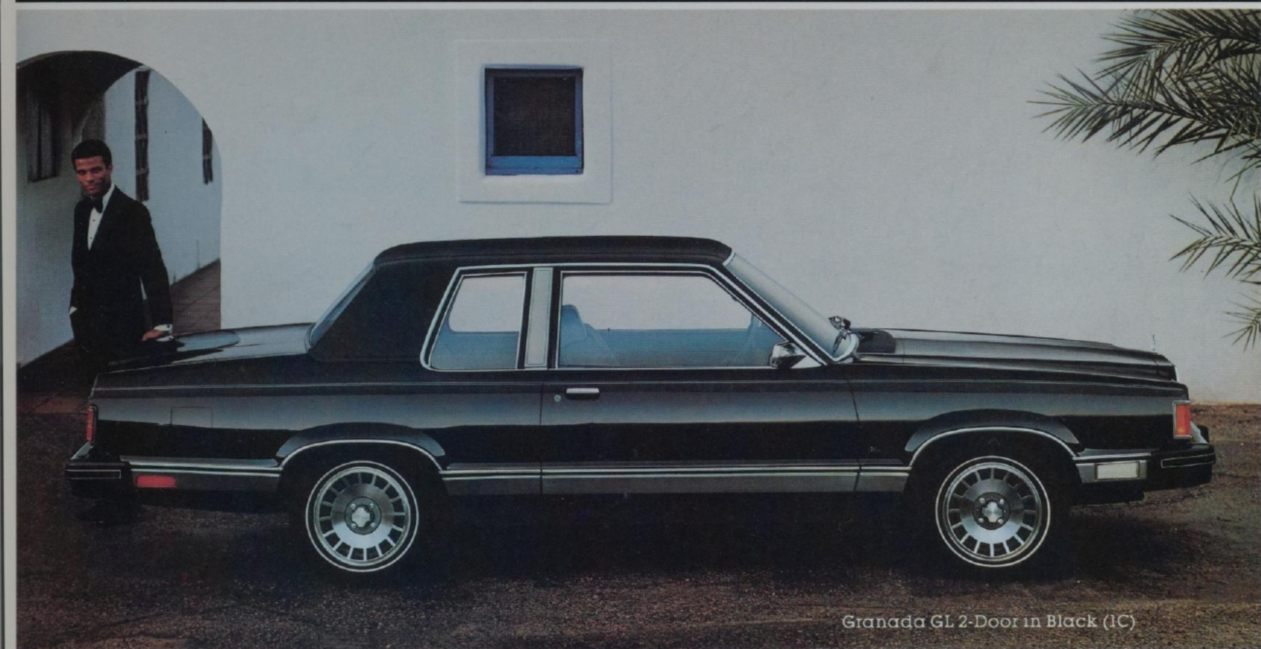
Granada GL 2-Door in Black (1C)