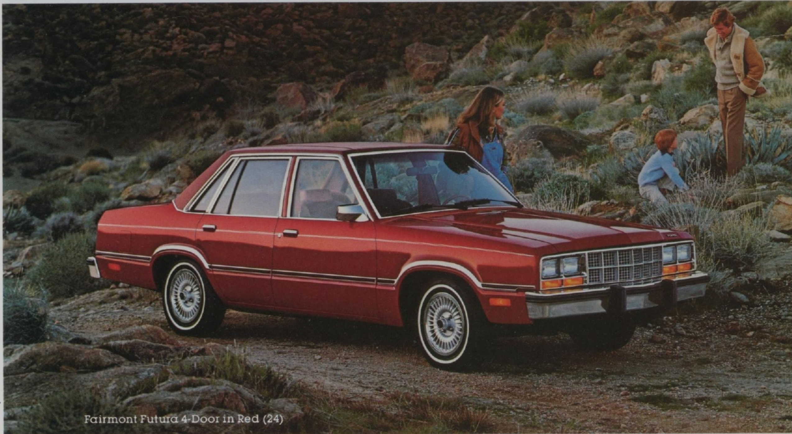
Fairmont Futura 4-Door in Red (24)