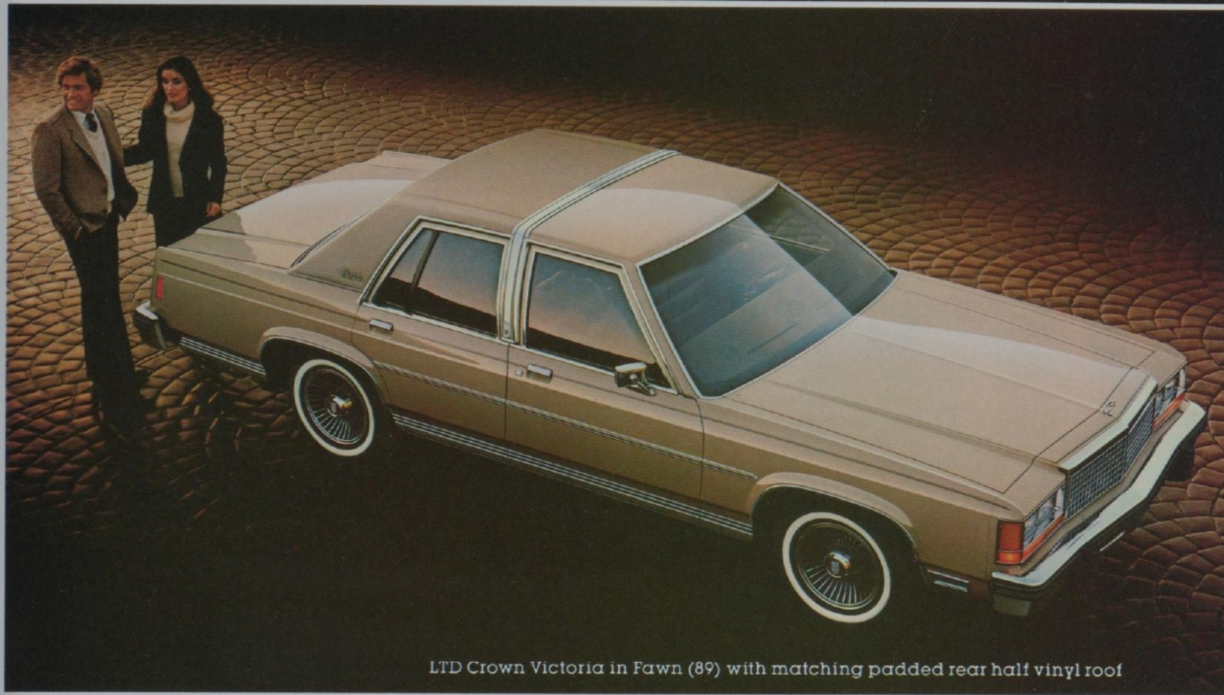
LTD Crown Victoria in Fawn (89) with matching padded rear half vinyl roof