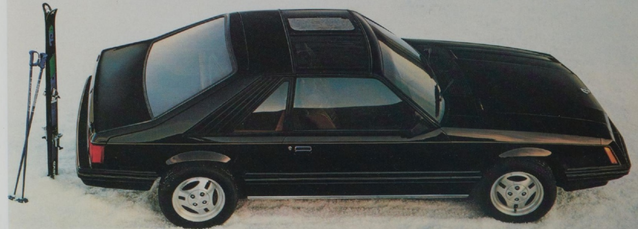
Mustang Ghia in Black (1C) with new T-Rooftop option