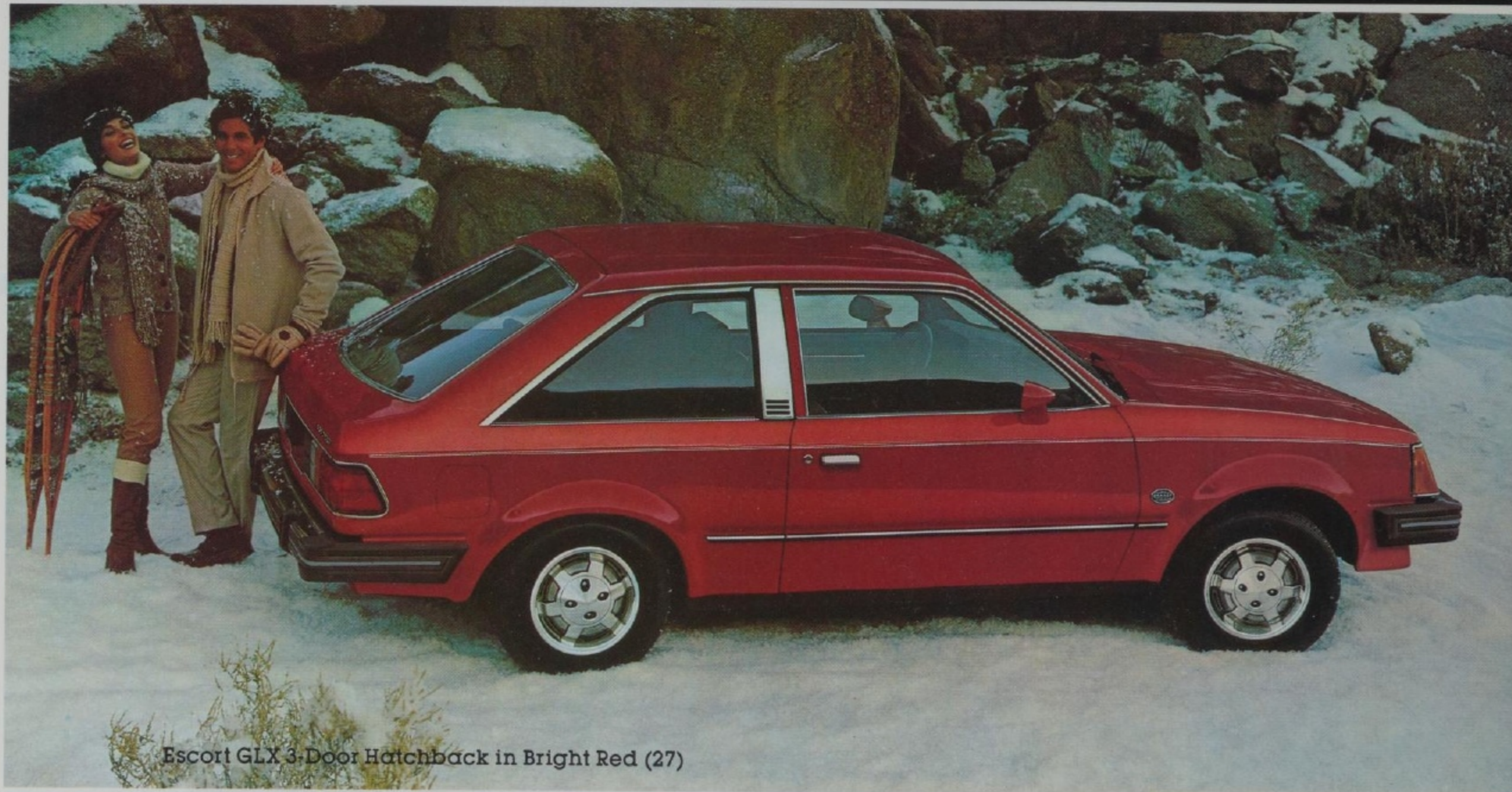
Escort GLX 3-Door Hatchback in Bright Red (27)