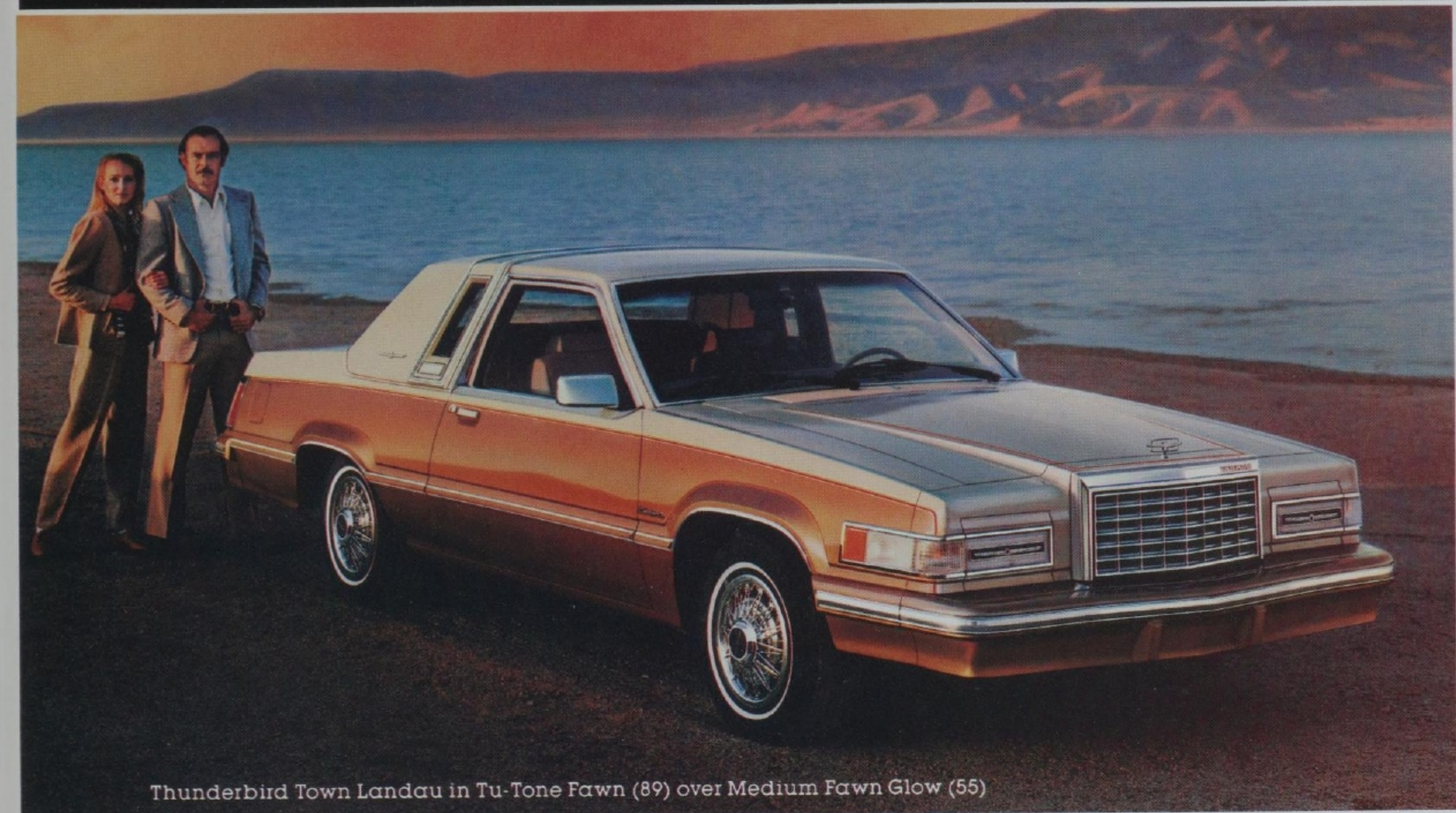
Thunderbird Town Landau in Tu-Tone Fawn (89) over Medium Fawn Glow (55)