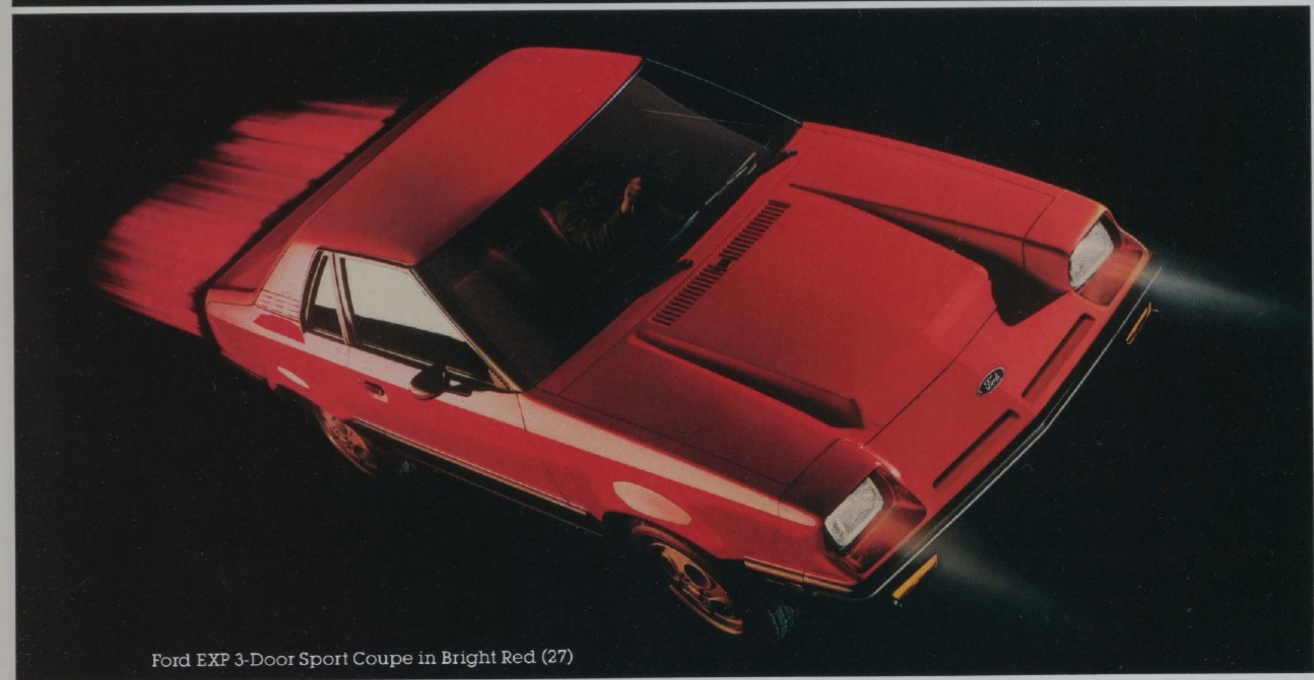
Ford EXP 3-Door Sport Coupe in Bright Red (27)