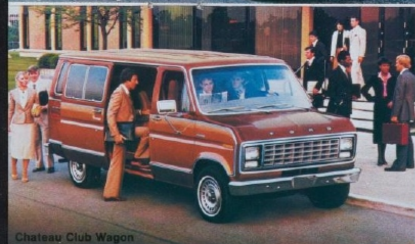
Chateau Club Wagon