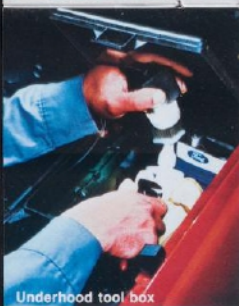
Underhood tool box