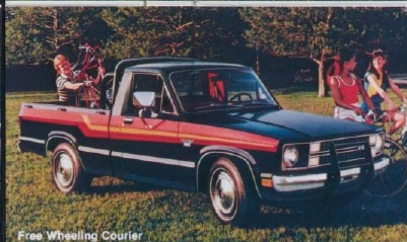
Free Wheeling Courier