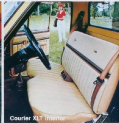
Courier XLT interior