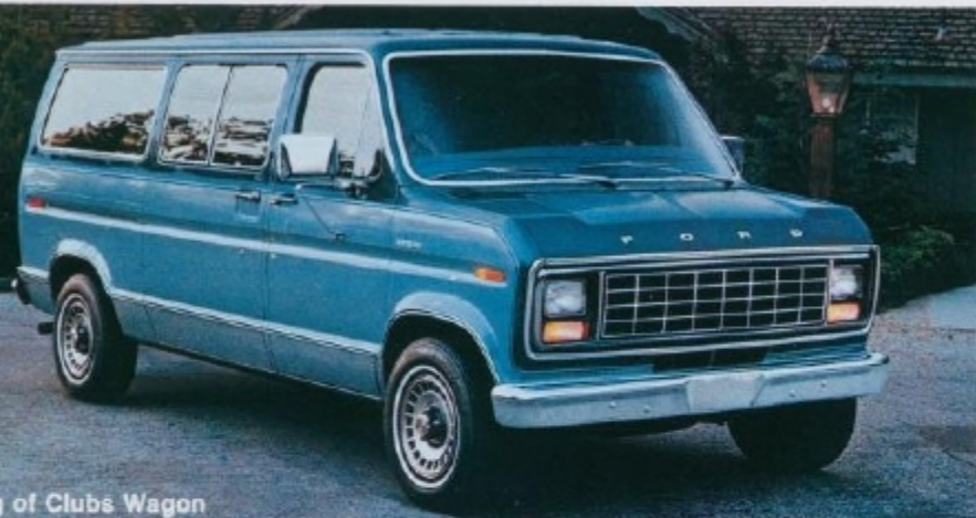
King of Clubs Wagon