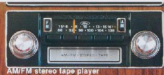
AM/FM stereo tape player