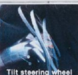
Tilt steering wheel