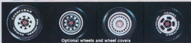
Optional wheels and wheel covers