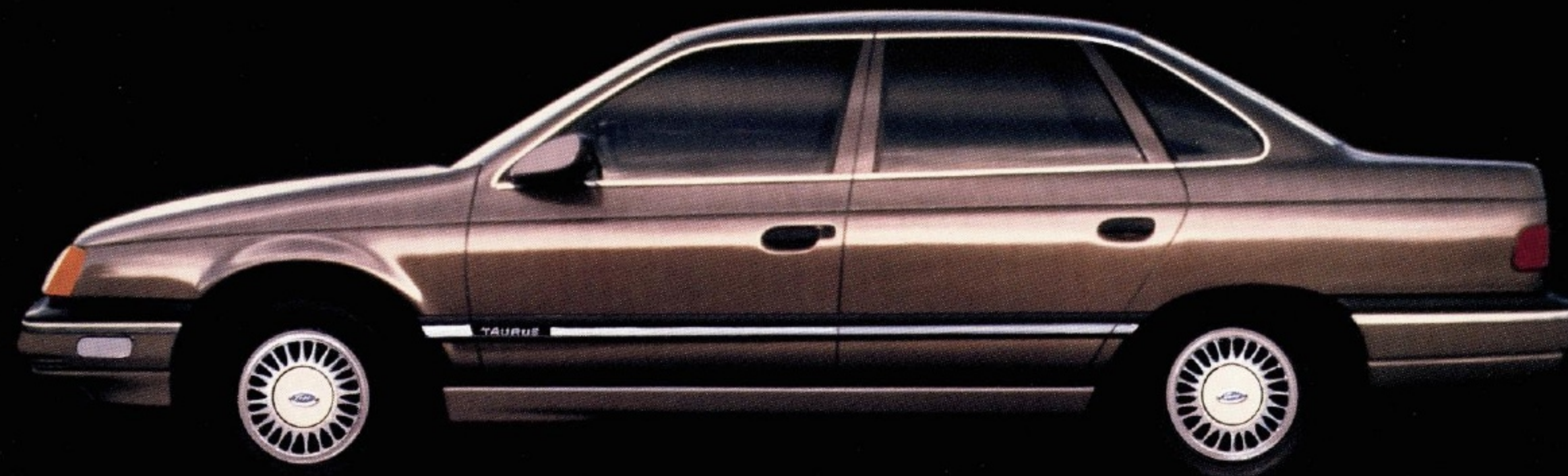
TAURUS SEDAN WITH OPTIONAL EXTERIOR ACCENT GROUP