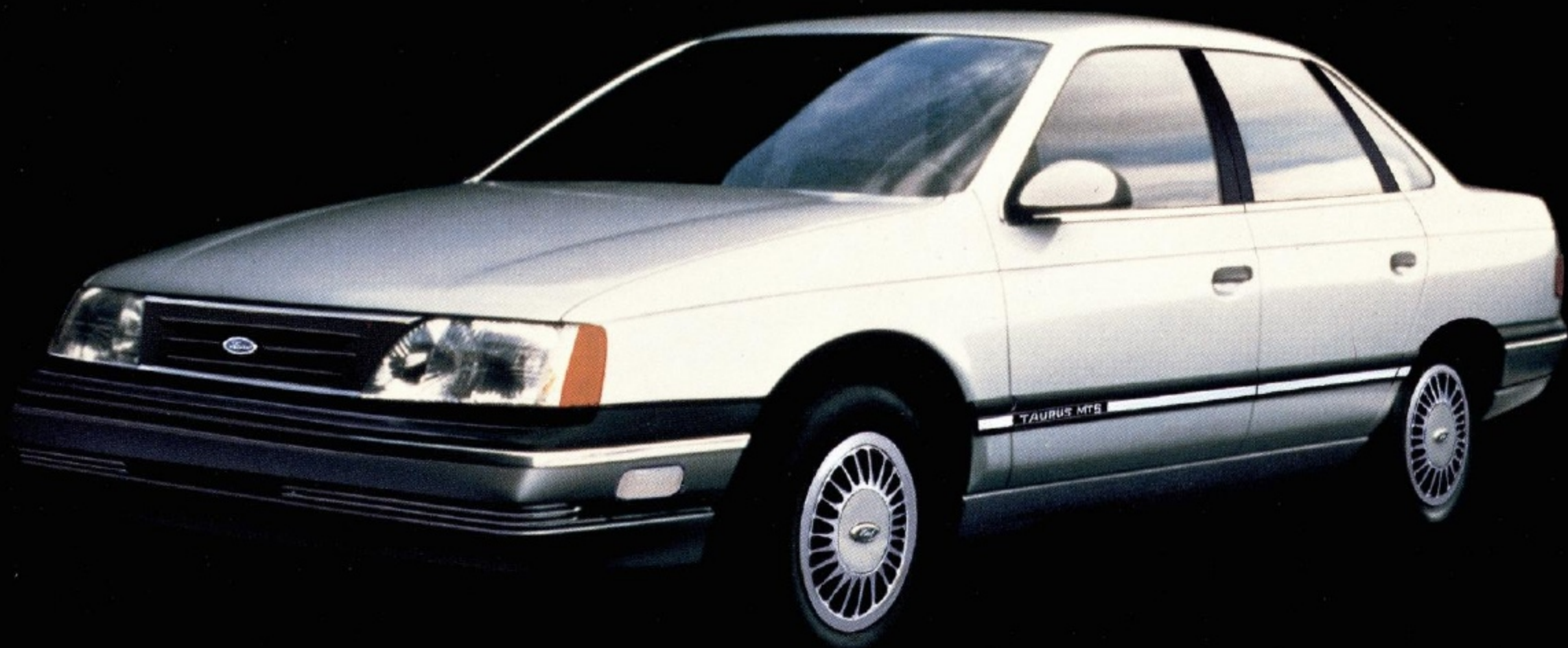
TAURUS MT5 SEDAN