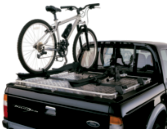
Mountain Top with cycle carrier and cross bars