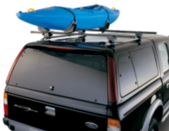
Truckman hardtop and canoe carrier