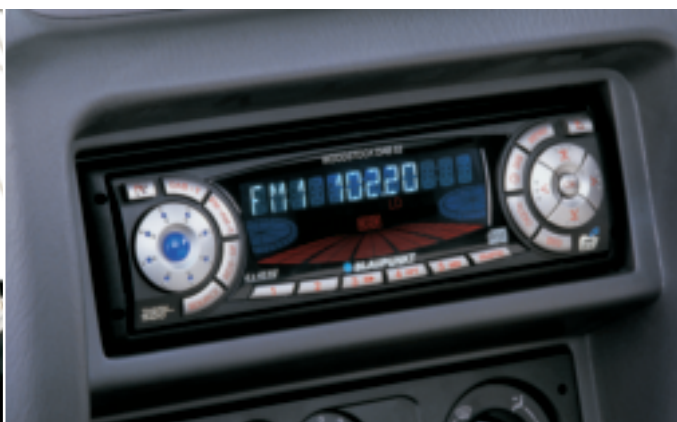
DAB digital radio