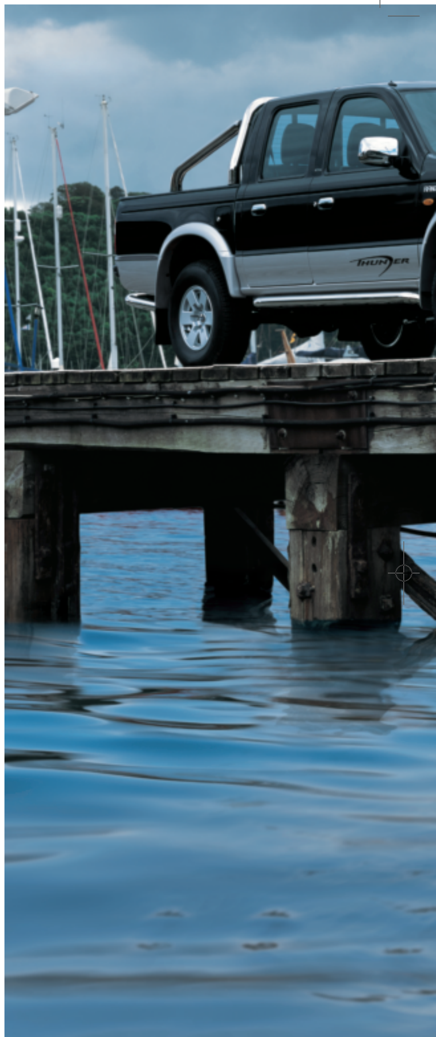
Model shown features accessories at extra cost.