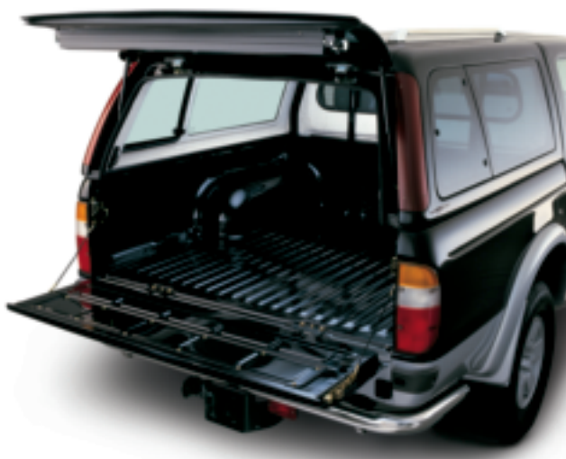
2 Accessory Special Edition Truckman 'Thunder' hardtop

When it comes to power and performance, the Ford Ranger Thunder is equally well endowed. A 2.5-litre turbo intercooled diesel engine, 4x4 capability and independent front suspension means it handles like a car and carries up to five people plus a full one-tonne payload with ease, whatever your destination.