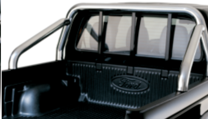
Sports bar and load liner