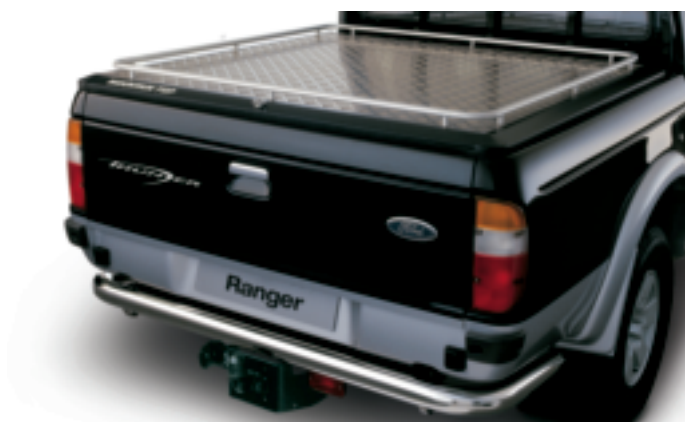
Mountain Top and tow bar