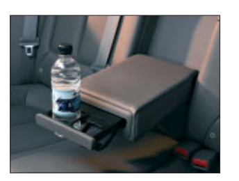
Rear Centre Armrest with Integrated Cup Holder