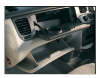
Twin Glove Compartment