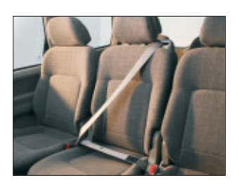
3 Point Seatbelt