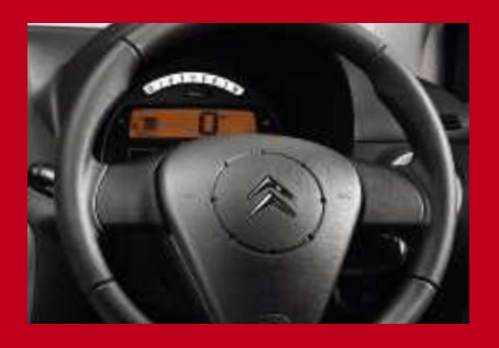
With its height and reach adjustable leather steering wheel, C2 VTS offers you the optimum driving position and gives your hands a lot of grip. Variable power assisted steering allows you to manoeuvre with ease and firm control, even at high speeds.