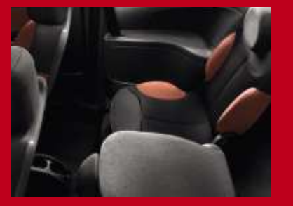
When just three people are on board, either of the rear seats can be folded down to make space for suitcases or other large objects.