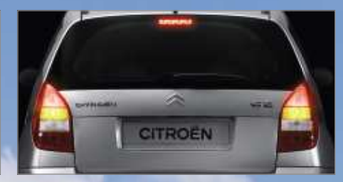
In the event of rapid deceleration, the hazard warning lights are automatically activated to alert other drivers.