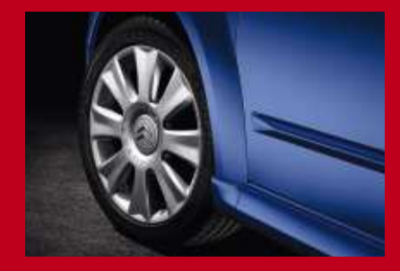
Aesthetics counts as much as performance — broad Suzuka alloy wheels with low profile tyres complete the C2 VTS' sporty look and maximise road holding.