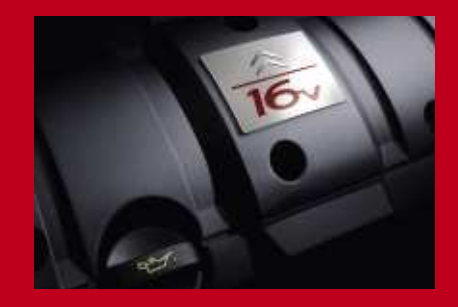
1.6 litres, 16 valves, 125hp... C2 VTS' engine is the perfect expression of the car's character: responsive, dynamic, full-blooded. The spontaneity of acceleration, coupled with the engine's flexibility will satisfy the needs of even the most passionately sporty driver.