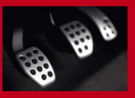
Sporty down to the last detail! The expression of the VTS' spirited personality extends to the pedals under your feet, designed to enhance the dynamism of the driving experience while matching the high quality interior of the C2 VTS.