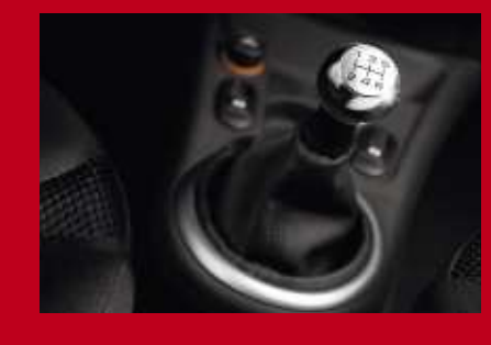
The stylish chrome-finish gear knob ensures excellent driving sensations, worthy of competition!