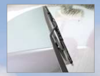
Rain sensors<sup>†</sup> automatically trigger the wipers at the first