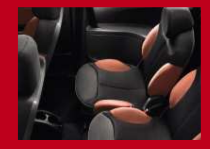
The two rear seats slide independently, creating additional boot storage when necessary.

Modularity doesn't come close to describing the flexibility that the Citroën C2 rear seating<sup>†</sup> can offer. It can be simply adapted to any requirement. The seats are independent of each other and so can slide, fold and be moulded to your every need.