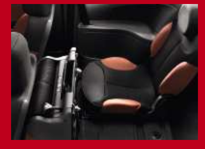
The seat can then also swing up 90°, assisted by gas struts creating a massive 879 litres of storage space when both rear seats are folded.