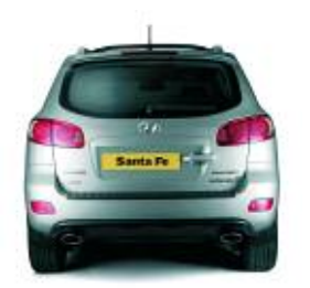
1615mm (63.6") Front track 1620mm (63.8") Rear track

Specifications shown in this brochure are based upon the latest available information at the time of printing.