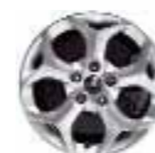
16" 5-spoke alloy wheel. (Option)