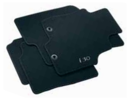
Carpet mat set