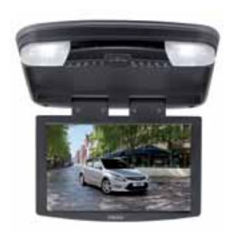
Overhead DVD system