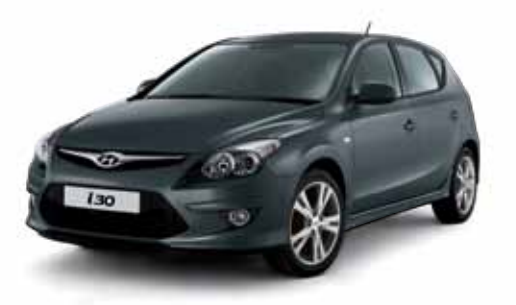
Steel Grey - Metallic