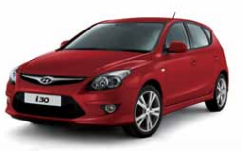
Glowing Red - Mica