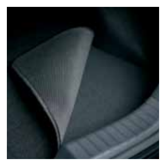
Reversible boot mat