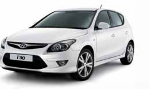
Creamy White - Solid