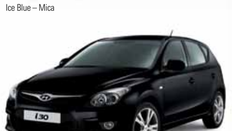
Phantom Black - Metallic