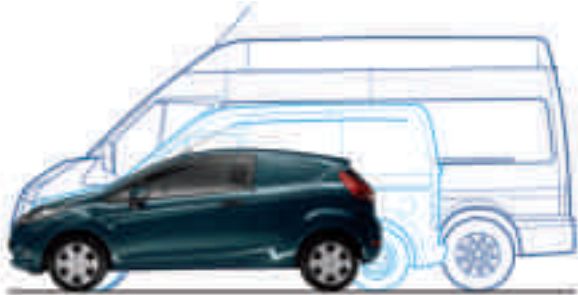
Model: FiestaVan Trend