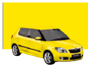
Sprint Yellow*** F2F2