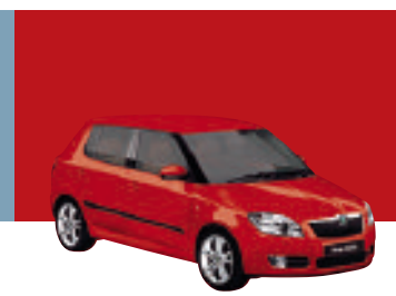
Corrida Red* 8T8T