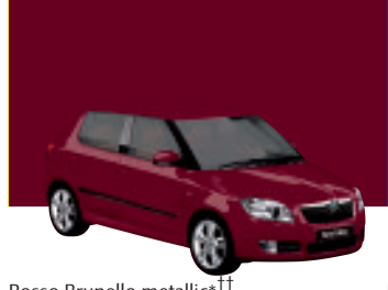
Rosso Brunello metallic* T