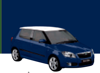
Pacific Blue <sup>†</sup> Z5Z5