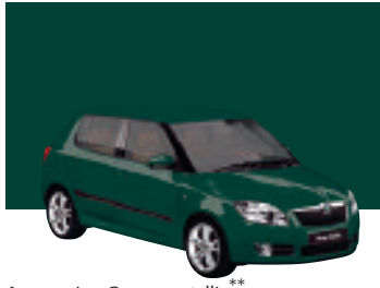
Amazonian Green metallic