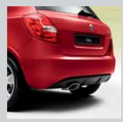
Diffuser (FAA 710 001) Noble steel exhaust pipe end piece (FDC 710 001–5A – depends on engine)