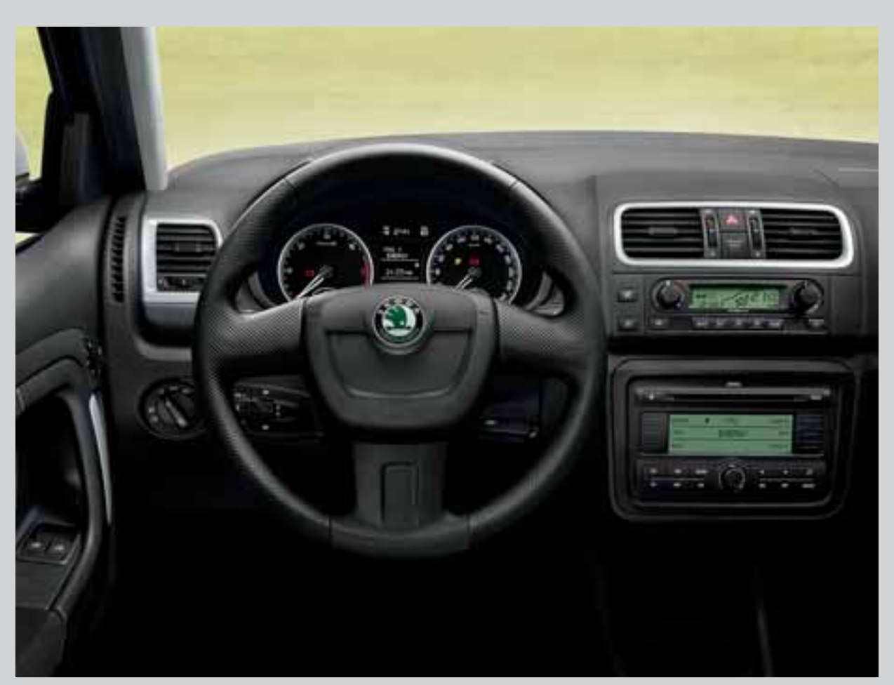
3-spoke perforated leather steering wheel