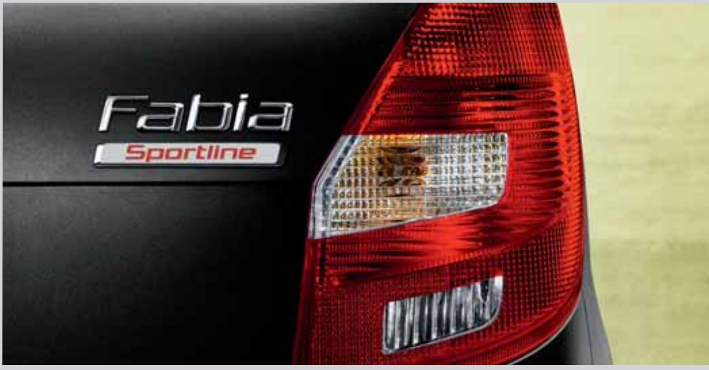
Sportline badge on the fifth door