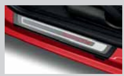
Sportline decorative door sill covers (KDA 700 003)