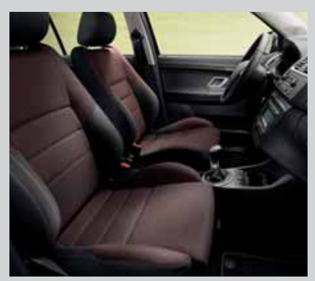
Pulse Red interior*