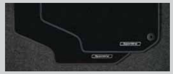
Removable woven carpets with coloured stitching