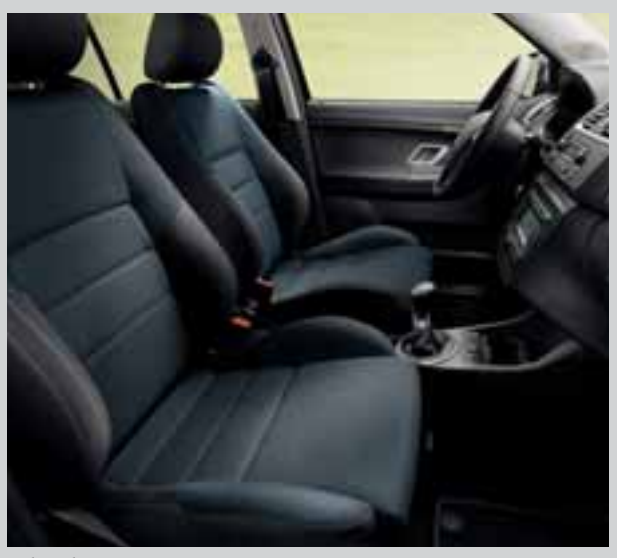
Pulse Blue interior*