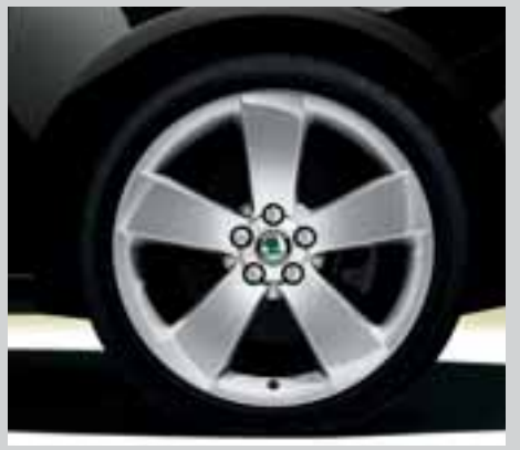
7.0J x 17" Kentaur alloy wheels