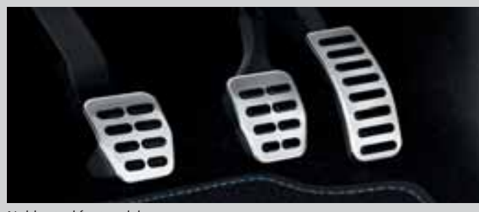
Noble steel foot pedal covers