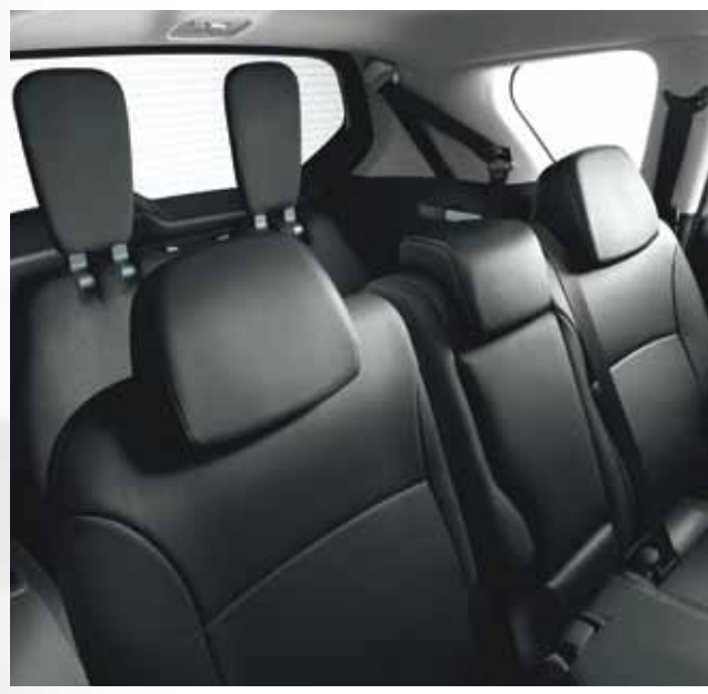
> THE CITROËN C-CROSSER IS A VERY SOCIAL VEHICLE

Its well thought out seating system of five standard seats, plus two fully retractable seats on Exclusive models that fold into the boot floor, means there's more than enough room for seven people to mingle. The comfortable sport seats, available in cloth or leather, not only look great but also provide an excellent driving position.