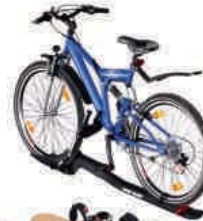
Mont Blanc 'Barracuda' bike carrier Specially designed to carry modern bikes with frames up to 80 mm in diameter. Also features integral locks to keep bikes safe and secure. (Accessory)