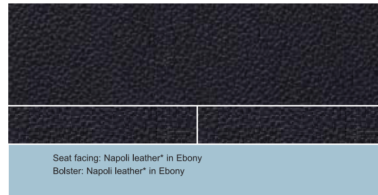
Seat facing: Napoli leather* in Ebony Bolster: Napoli leather* in Ebony

*Leather trim is optional at extra cost.