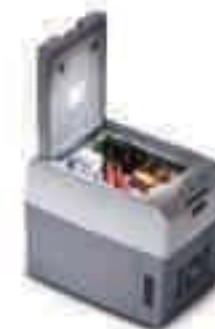
Waeco coolbox High-performance 35-litre capacity box cools down to a minimum of 1°C. Integrated 230V AC connector. (Accessory)