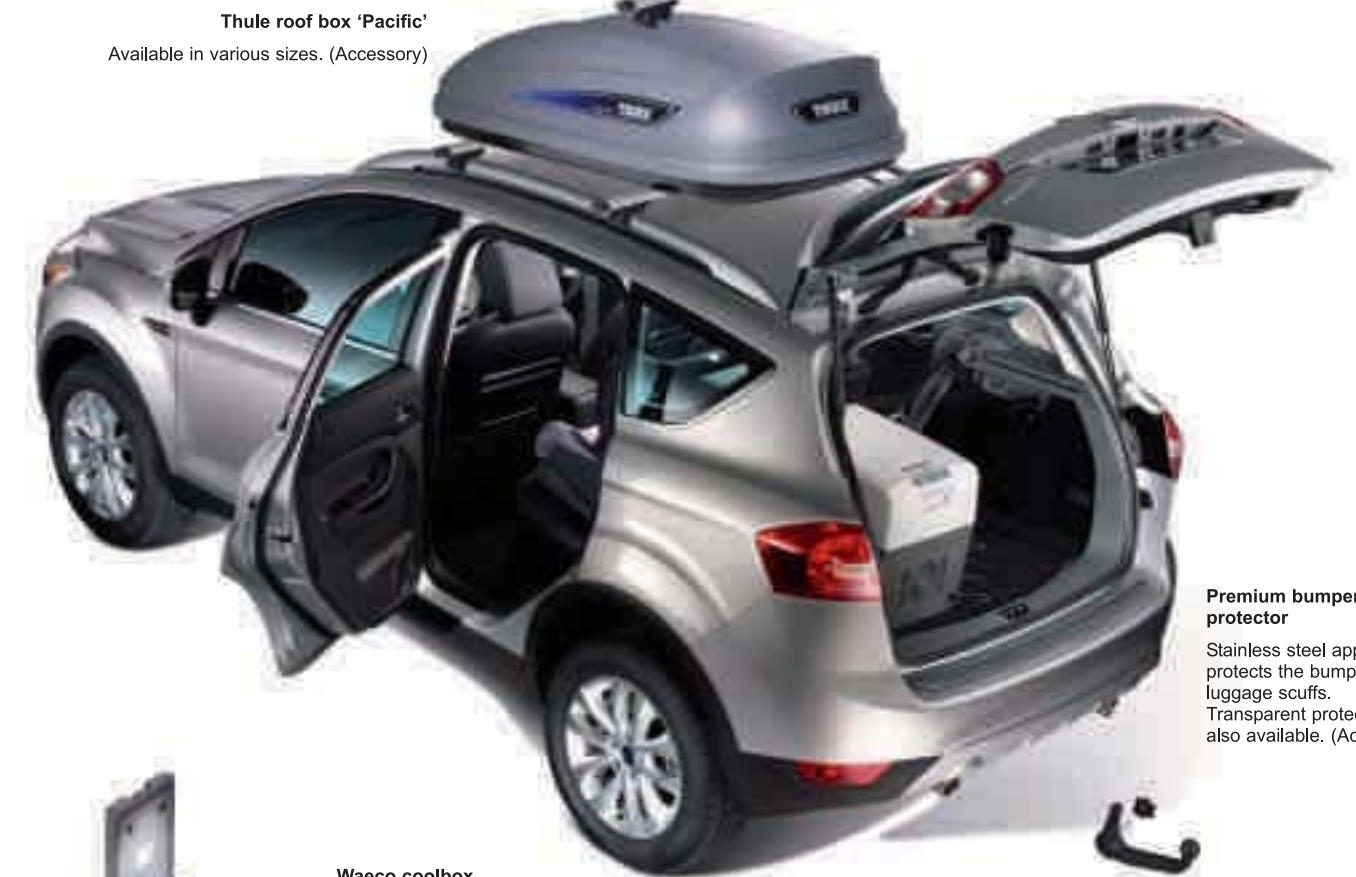
Premium bumper protector Stainless steel appearance protects the bumper from luggage scuffs. Transparent protection foil also available. (Accessory)