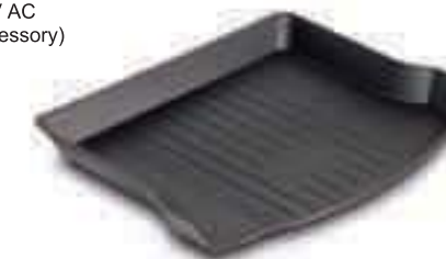
Loadspace liner Extra solid liner with 100 mm lip height, ideal for transporting wet or dirty items. (Accessory)