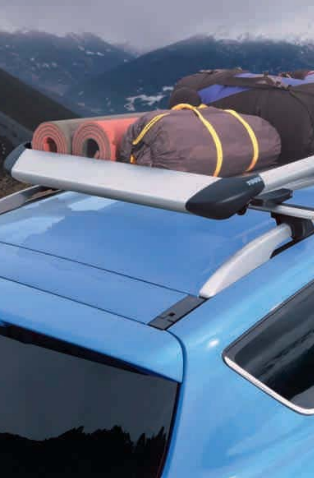
Thule 'Xpedition' carrier basket A versatile basket platform for a variety of loads. Made of lightweight, robust aluminium. (Accessory)