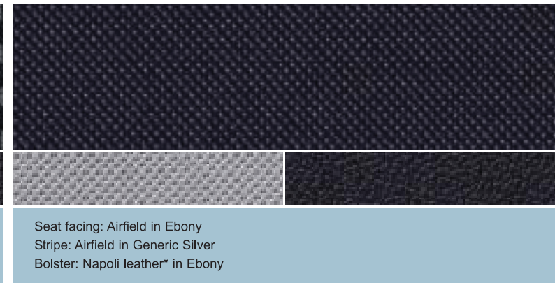
Seat facing: Airfield in Ebony Stripe: Airfield in Generic Silver Bolster: Napoli leather* in Ebony