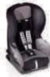
Britax Römer child seat Various seats available for all ages – also available with ISOFIX. Removable and washable cover. (Accessory)