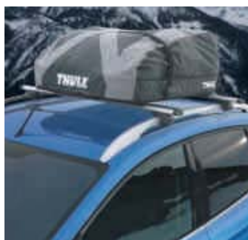
Lockable crossbars Made of solid aluminium, these bars form the base for all attachments such as roof boxes, bike carriers, ski racks, etc. (Accessory)