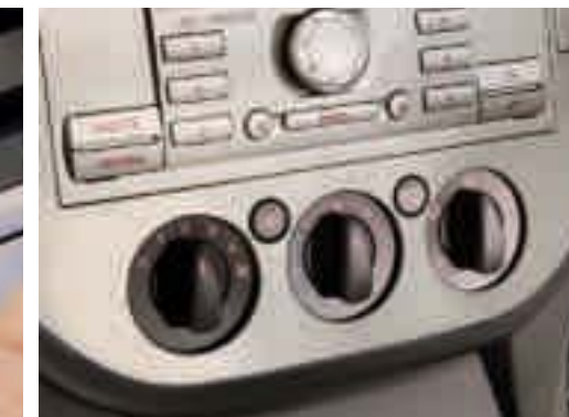
MP3 connection Play music directly from your MP3 player through the Ford Kuga's stereo. (Standard)